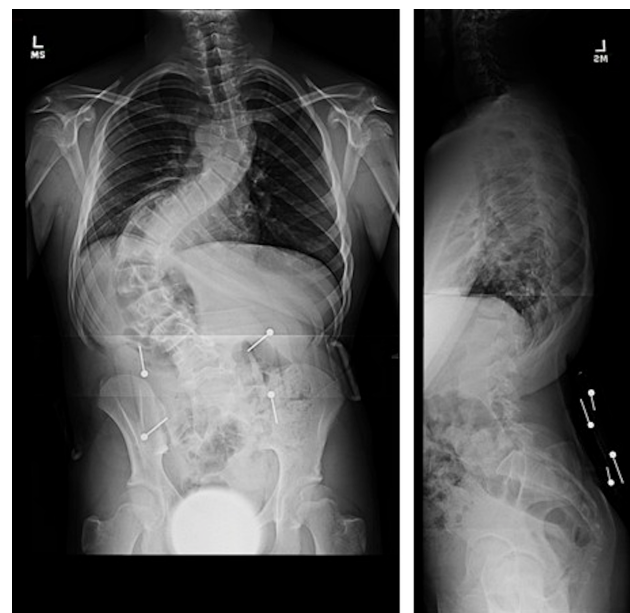
Fig. 1. Pre-operative coronal (left) and sagittal (right) radiographs of a 17 year old male with adolescent idiopathic scoliosis. Main Thoracic curve= 71 degrees (bending= 54); TL/L= 91 degrees (bending= 73).

We retrospectively examined a cohort of AIS patients undergoing a posterior only spinal fusion from a prospective randomized trial (Figure 1). 8 During the prospective trial 125 patients were randomized to Tranexamic acid (TXA), Aminocaproic acid (EACA), or Saline (control) for surgery from January 2009 to January 2011. Level-1 data from this homogeneous population minimizes the effect of confounding variables. For the current study the 125 patients were separated into two groups based on their pre-operative blood donation history and compared in terms of their pre-incision Hct. All patients in the prospective study had a complete blood count drawn just prior to incision. 8 Of the 125 patients enrolled in that study: 28 patients donated blood prior to surgery (PD group), 97 patients did not pre-donate blood (Non-PD group).