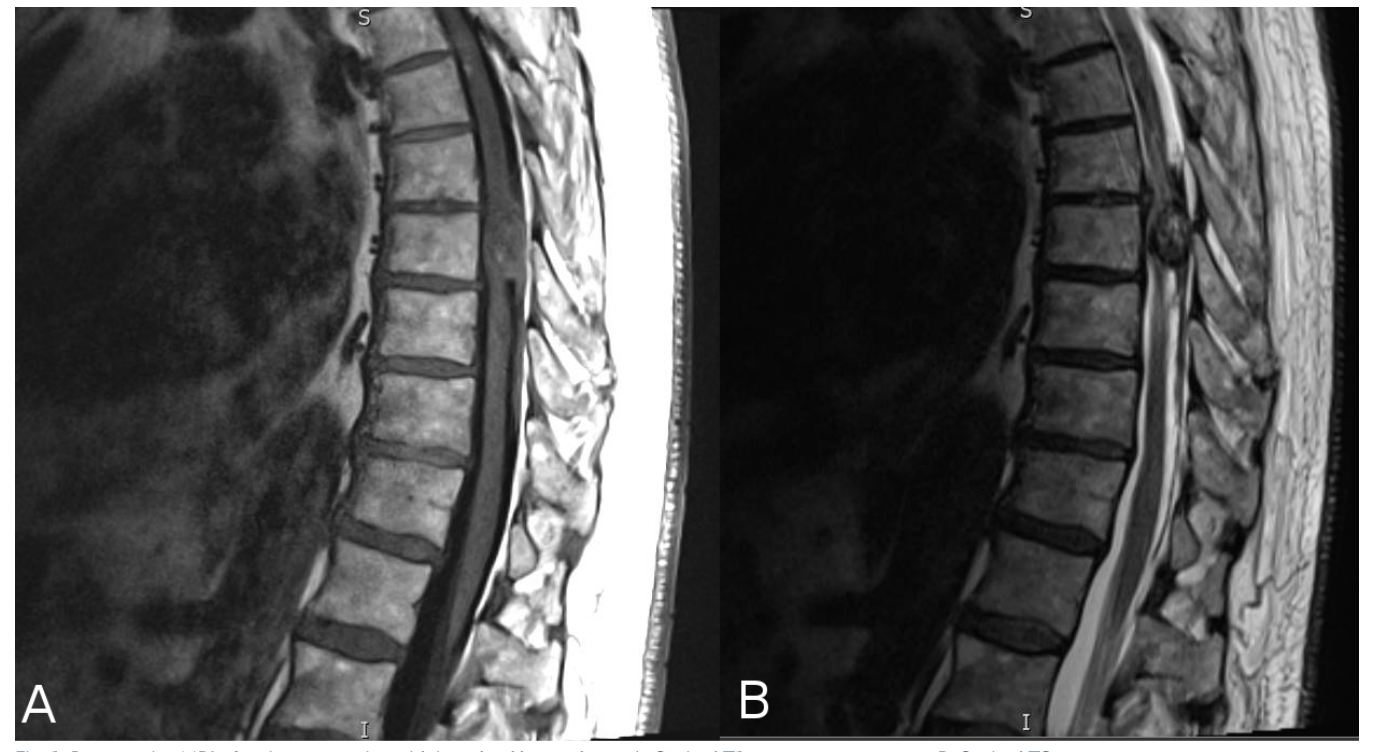
Fig. 1. Preoperative MRI of patient presenting with intradural hemorrhage. A. Sagittal T1 nonconstrat sequence. B. Sagittal T2 sequence.

Hemorrhagic conversion of a spinal schwannoma is rare. Several reports have described the presence of intracranial subarachnoid hemorrhage in the setting of a distal spinal schwannoma.<sup>4-7</sup> Similarly few reports have described hemorrhagic conversion of spinal schwannomas presenting with spinal hematomas and related symptoms.<sup>8-16</sup> These reports have described hemorrhage from spinal schwanno-