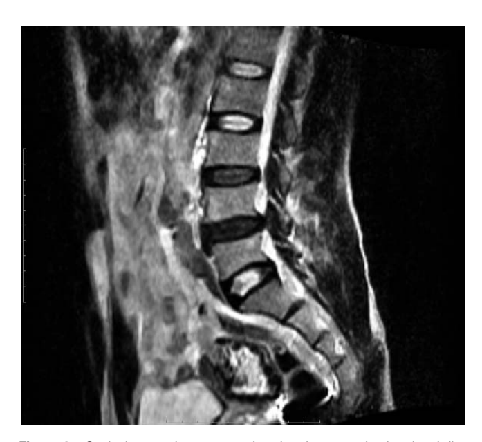
Figure 4. Sagittal magnetic resonance imaging demonstrating herniated disc at L4-5, L5-S1.

Overall mean angle (Table 2) in Group 1 in the sitting position was 40 \pm 7^{\circ} compared to Group 2, which was 35 \pm 3^{\circ} , P = .616. In the supine position, Group 1 angles were 34 \pm 5^{\circ} compared to 35 \pm 2^{\circ} in Group 2, P = .49. Results demonstrated no statistical significance between angles in both groups