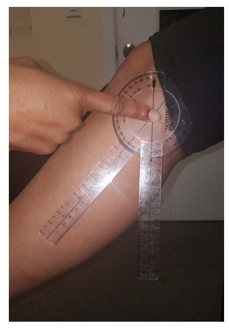
Figure 1. Technique of measuring straight-leg raise in sitting position.

Patients presented to the spine clinic with HNPs, radiculopathy, and spondylolisthesis. We were particularly interested in the diagnosis of HNPs (Table 1). For each patient, documentation of