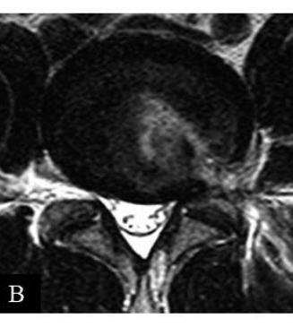
Figure 3. At 5 days after revision percutaneous endoscopic discectomy (PED) surgery, the discal cyst disappeared on T2-weighted magnetic resonance imaging (A) sagittal and (B) axial views.

etiology are still unclear. Chiba et al<sup>6</sup> reported that the cyst wall consists of dense fibrous connective tissue containing bloody to clear serous discharge and suggested that underlying minor disc injury may serve as a basis for cyst formation. Kono et al<sup>7</sup> noted that a discal cyst results from focal degeneration and cystic softening of collagenous connective tissue of the disc with fluid production, similar to the mechanism of meniscal cysts in the knee. There are several reports<sup>1,8</sup> that histopathological findings show predominantly fibrous connective tissue without synovial lining cells.