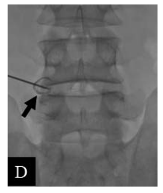
Figure 2. Postoperative radiographic findings at 6 weeks show a cystic lesion on the left side of L4-L5 disc on T2-weighted magnetic resonance imaging (A, B) and enhancement of the mass on contrast radiography (C, D).