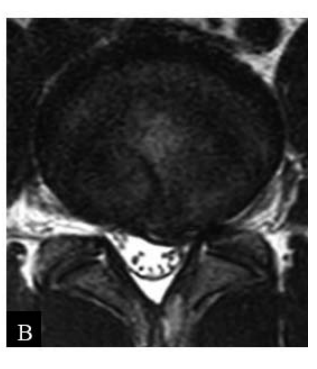
Figure 1. Preoperative T2-weighted magnetic resonance imaging (MRI) (sagittal view) shows disc hemiation at the L4-L5 disc level (A) and axial view of MRI shows left side hemiation (B).

return to work, but he subsequently experienced severe low back pain again during physical activity 2 weeks after the injection.