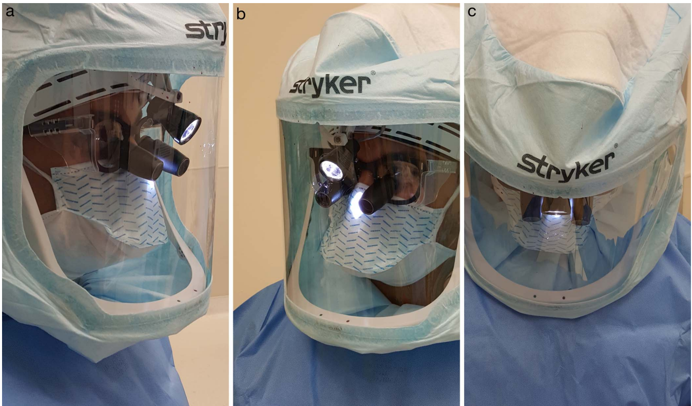
Figure 1. Lateral (a), oblique (b), and axial (c) images of a space suit with integrated headlight. The face shield is far enough anterior that it does not contact or impede the loupes. The orientation of the headlight and relative posterior position of the light relative to the loupes prevent glare by the light from impeding the visualization of the loupes.

ultraclean-air system, incidence of joint sepsis was approximately 25% of operations performed with conventional ventilation. 1 The BES tubing was later replaced by the less cumbersome surgical helmet system (SHS), consisting of a portable helmet and hood. Today, this SHS, or what is commonly referred to as the orthopedic “space suit,” is used almost uniformly in orthopedic joint replacement surgery. These suits require specialized ventilated helmets and clear facial coverings. Traditionally, such space suits are not utilized in spine surgery due to difficulty with light illumination and potential reflection of light from the facial covering. Recently, a new helmet/space suit system was developed that is lightweight and features an integrated, adjustable headlight (Figures 1a–c). The integrated headlight offers a comparable illumination to the headlights commonly worn in spine surgery. The sterile face shield and attached hood covers the surgeon’s face (including loupes), chin, and neck.