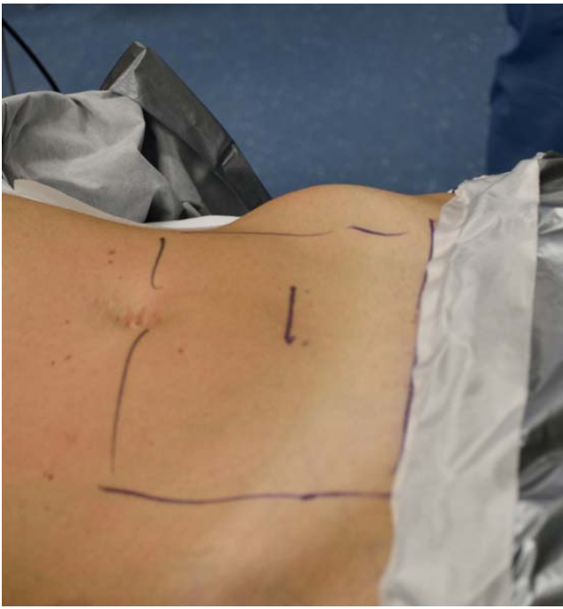
Figure 1. Surgical exposure of anterior lumbosacral spine is obtained through a skin incision in lower abdominal quadrants. Our preliminary experience is based on a linear horizontal skin incision of 6 to 8 cm in length, 5 to 7 cm beneath the umbilicus.

The arcuate line was then identified and cut in its most lateral portion, thus exposing the peritoneum and the left ureter, which were gently retracted medially, until the exposure of psoas muscle and big vessels was obtained. The L5–S1 disc space, our target, was identified between the bifurcation of aorta and cava into the 2 common iliac arteries and veins, respectively. After the complete exposure of the disc through retraction of each common iliac vessel on the respective side, deep retractors were inserted and fixed to the bony surface. Exoscope VITOM 3D (Karl Storz, Tuttlingen, Germany) was then inserted in the operating setting and maintained over the surgical field for the rest of the duration of the procedure. It consists of a specially developed telescope with zoom and focus functions, integrated illumination, and fiber optic light transmission. It is kept in position by an articulated, mobile, mechanical, holding arm (VESACRANE™, Karl Storz Endoscopy, Tuttlingen, Germany). Through a control unit, the surgeon is usually able to focus, modify the magnification, and slightly shift the orientation of the scope. The surgical field was displayed on 2 movable 32" 3D monitors positioned on the opposite side of the surgical table respect to surgeon and assistant positions, which are usually