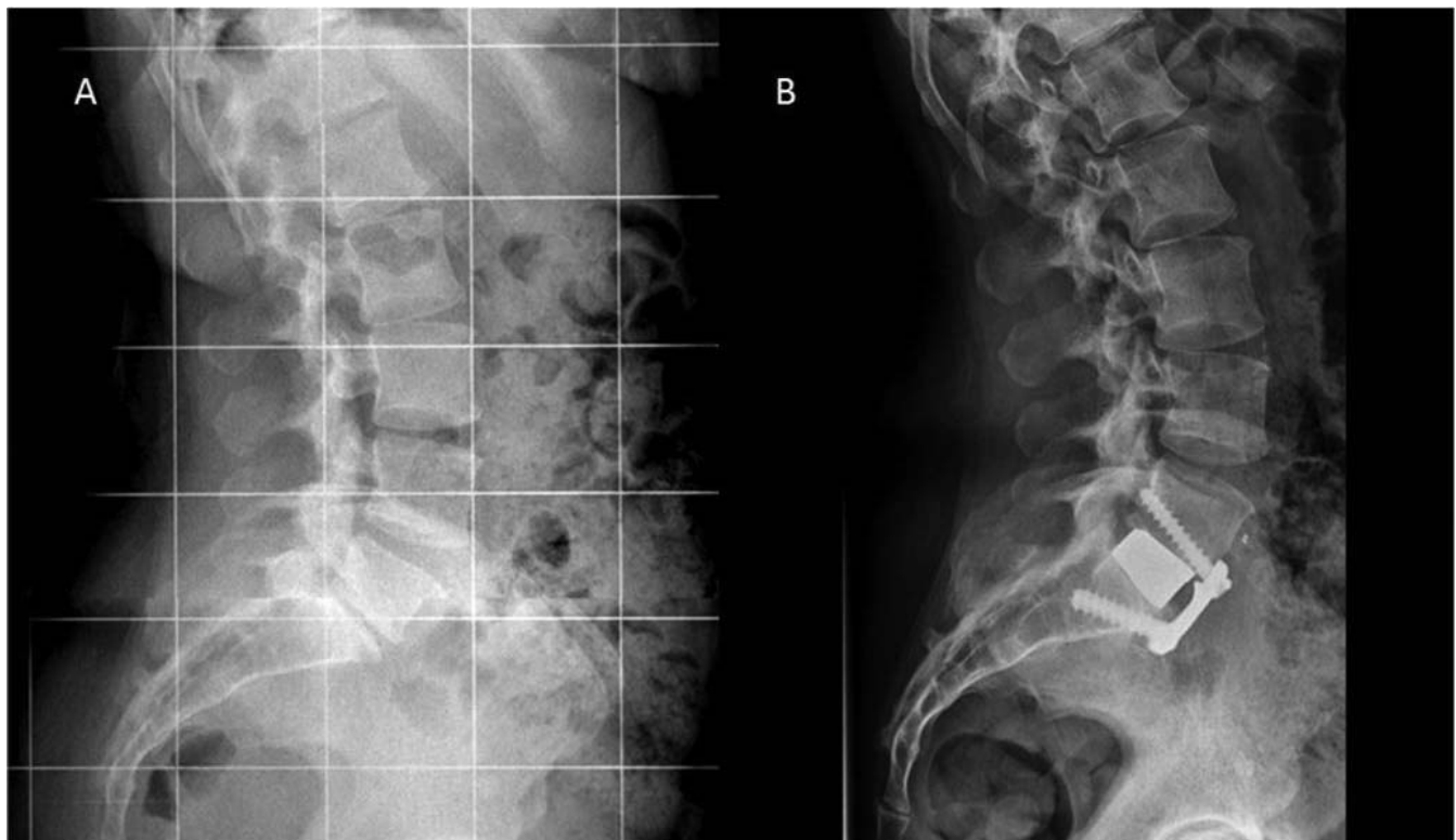
Figure 4. L5-S1 anterior lumbar interbody fusion (ALIF): X-rays presurgery (A) and postsurgery (B). Anterior access to the intervertebral space allows an easier insertion of angulated cages, when compared with posterior approaches, thus generating a satisfactory restoration of lumbar lordosis and spino-pelvic balance. Moreover, the restoration of disc height obtains increase of neuroforaminal volume and consequent relief of radicular symptoms due to indirect decompression.

The surgical procedure was performed in 9 patients affected by degenerative L5-S1 discopathy, complaining of low back pain not responsive to conservative treatments; 7 of them also reported radicular pain exacerbated by orthostatism; 1 of them had a previous interlaminar approach for herniectomy. Intraoperative x-rays and postoperative computed tomography scan showed satisfactory radiological results, consisting of segmentary restoration of physiological lordosis and widening of neural foramina (Figure 4). All patients reported satisfactory lumbar and radicular pain relief; no general and instrument-related complications were observed. Postoperative courses were uneventful with no significant pain, allowing early patient mobilization, and a brief hospitalization with discharge between 2 and 3 days after surgery. In surgeon personal experience, the adaptation to the exoscope was quite easy and immediate, requiring a gentle and shorter learning curve in comparison with the training in endoscopic technique.