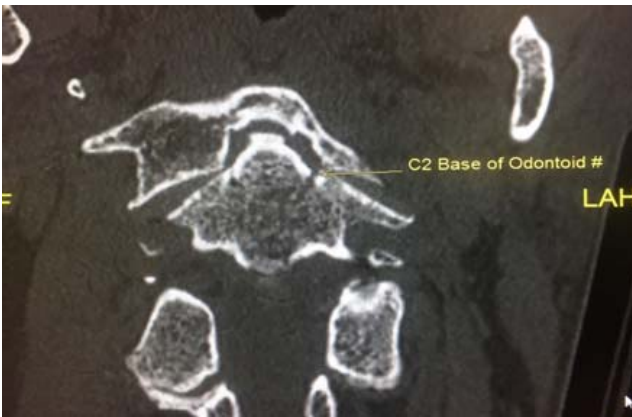
Figure 2. Type 2 odontoid fracture.