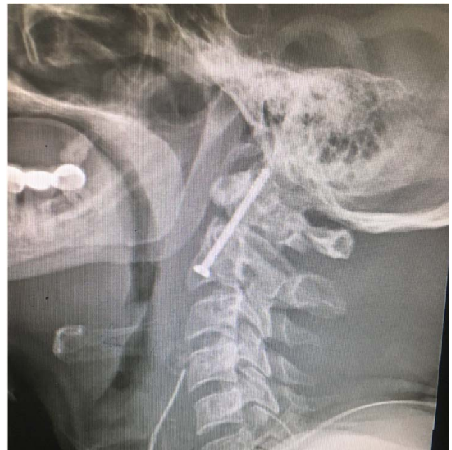
Figure 6. Odontoid process fixation.