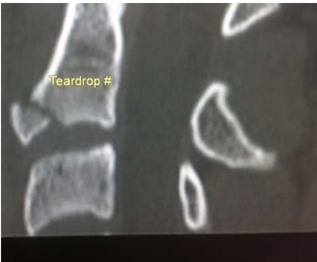
Figure 3. Teardrop fracture.