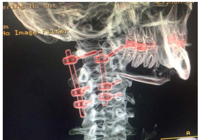
Figure 5. Reformatted image: C1-C4 posterior fixation.