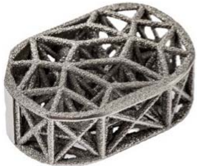
Figure 1. 4WEB Anterior Spine Truss System (ASTS) interbody fusion implant (4WEB Medical, Frisco, TX, USA).

This prospective randomized controlled trial was conducted in accordance with the local Institutional Review Board authority under ethics committee number 178/14, at the Goethe University (Frankfurt, Germany) facility. All patients gave informed consent before entering the trial, and there was no