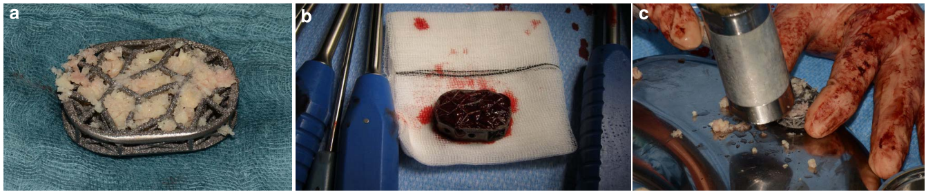
Figure 2. (a) Cage with crushed cancellous bone (CCB) alone packed into the cage. (b) Cage with bone marrow aspirate (BMA) clot packed into the cage. (c) CCB being packed into the cage.