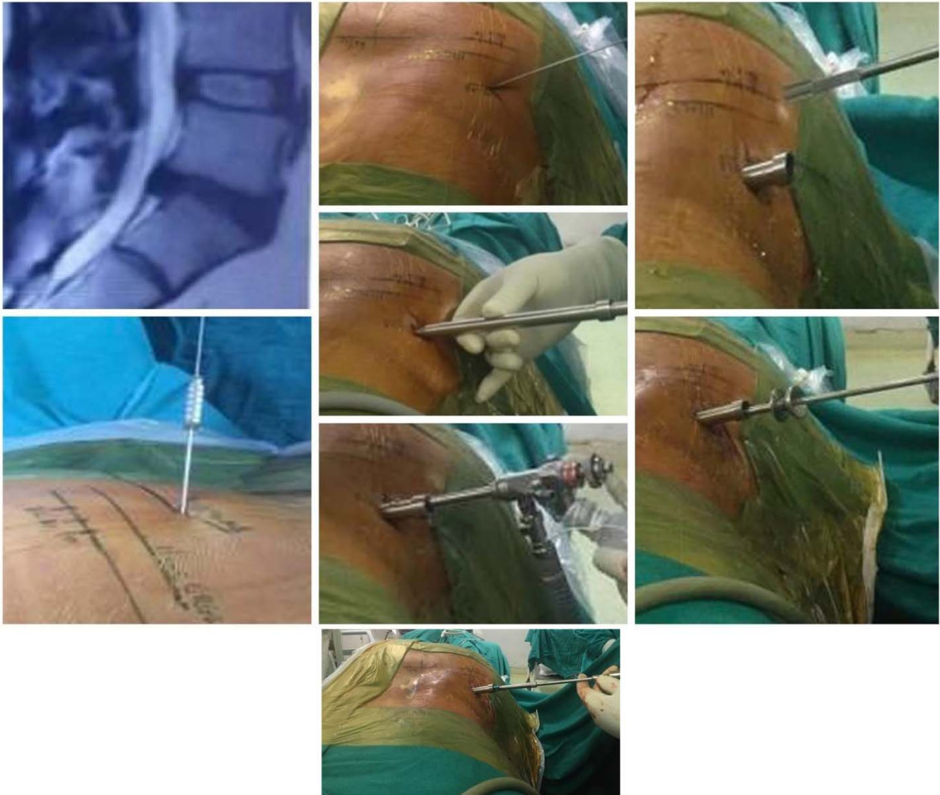
Figure 1. Preoperative sagittal MRI scan of a 55-year-old woman who underwent L5-S1 full endoscopic lumbar interbody fusion (FELTIF) with steps of the endoscopically assisted interbody fusion showing the foraminotomy, dilation, placement of the working cannula, endplate preparation with shavers, and endoscopic instruments under direct visualization. The surgical interspace is filled with bone graft through a graft funnel inserted through the endoscopic working cannula that rests within the disc space. The patient presented sciatica-type back and leg pain and had a positive straight-leg raise. Postoperatively, the VAS leg score was reduced to 2 from preoperative score of 7 and the VAS back score reduced 3 from preoperative score of 9. Her neurogenic symptom score improved from 8 before surgery to 1.

include degenerative or isthmic spondylolisthesis, degenerative disc disease, spinal stenosis with decompression-induced instability, postlaminectomy instability, and failed back surgery syndrome. Contraindications of the FELTIF procedure include vertebral fractures, osteopenia, poor bone quality due to osteoporosis, congenital abnormalities, infection, spondylodiscitis, signs of local inflammation, severe central stenosis, high-grade spondylolisthesis, and extremely small foramen due to advanced disc collapse or facet hypertrophy. Endoscopic spinal fusion aims to further reduce the surgical morbidity in the patient who requires spinal