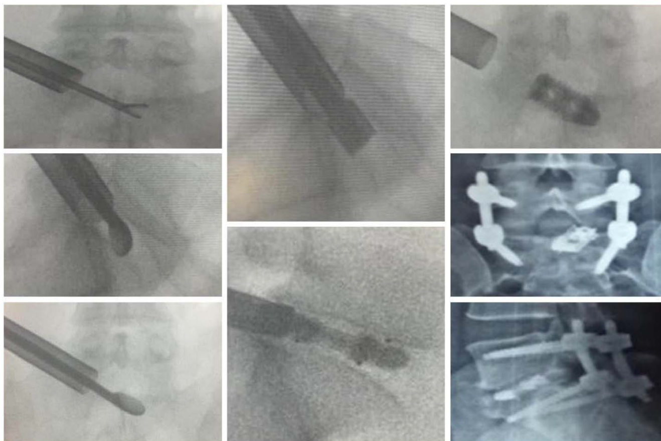
Figure 2. Intraoperative fluoroscopy images were taken during the L5-S1 full endoscopic lumbar interbody fusion (FELTIF) of a 55-year-old woman. The endoscopic discectomy, end plate preparation with curettes and shavers, and placement of the interbody fusion cage, as well as postoperative posteroanterior and lateral images are shown.

not associated with a psoas muscle injury, lumbar plexus, bowel and vascular injuries common to lateral or direct retroperitoneal approaches because it enters the spine posterior to the psoas major, thereby avoiding damage to the viscera. We are reporting on a percutaneous, endoscopically assisted transforaminal decompression and fusion surgery version of TLIF named FELTIF. Recent advances in video-endoscopic instrumentation allowed for aggressive bony decompression and foraminoplasty with resection of the lateral part of a hypertrophic facet joint by osteotomy of the anterosuperior migrated SAP. Resection of the SAP with partial pediclectomy and resection of end plate osteophytes for preparation is relevant for adequate decompression of the exiting nerve root in its axilla and creation of an adequately sized entry point for the insertion of the conical interbody fusion cage directly through the endoscopic working cannula. Violation of the end plates during decorication may expose the subchondral bone with vessel injury that is more likely to occur during open