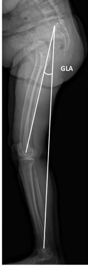
Figure 1. Ankle pelvic angle (APA) is defined as the angle between a line drawn from the bicoxofemoral axis to the midpoint of the sacral endplate and then from there to the ankle bimalleolar axis (left panel). Global lower extremity angle (GLA) is defined as the angle between a line drawn from the distal femoral bicondylar axis to the midpoint of the sacral endplate and then from there to the ankle bimalleolar axis (right panel).

of the cohort was female, the mean age was 58.41 years, and the mean BMI was 27.97. No significant difference existed in age, gender, or BMI between the cohorts with and without compensation. Mean KA was 13.4^{\circ} in patients with lower extremity compensation and 0.63^{\circ} in patients without (P < .001; Table 1). APA values ranged from -12.98^{\circ} to 35.44^{\circ} . GLA values ranged from -4.85^{\circ} to 13.24^{\circ} .