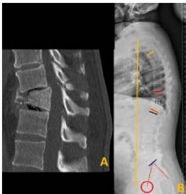
Figure 2. The case of a patient who had a car accident, which resulted in a misdiagnosed type B fracture that progressed to a fixed kyphosis. (A) Computed tomography showing the kyphotic deformity. (B) Lateral full spine x ray showing an unbalanced spine with a +61 mm sagittal vertical axis.

posterior ligament apparatus failure, or implant loosening (Figure 2).