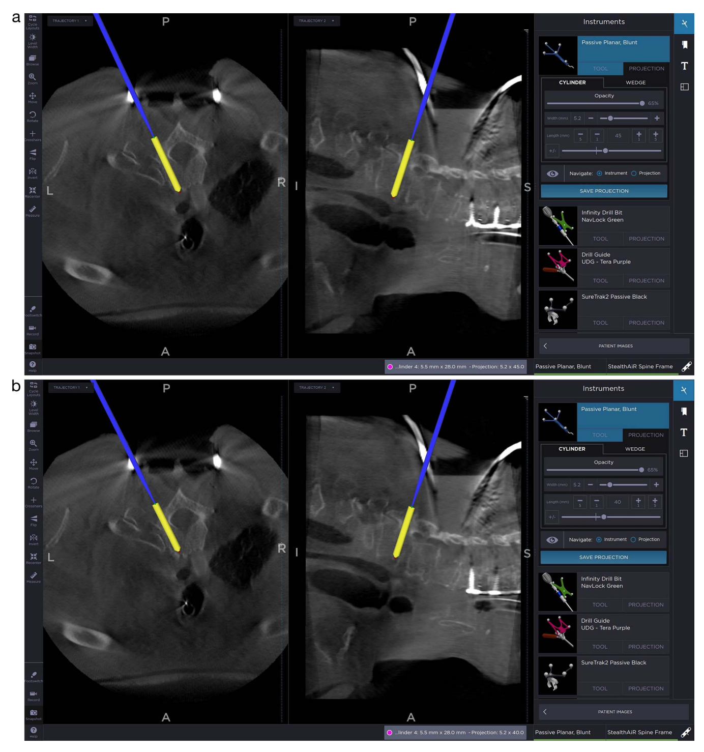
Figure 1. Evaluation of the upper thoracic costotransverse joint for assessment of extrapedicular versus transpedicular approaches. Also shown is adjustment of the pedicle screw length from 45 to 40 mm to avoid ventral breach.

difficult to accept multiple implants, especially in cases of smaller patients. The bottom left picture allows the surgeon to plan for more than one implant while staying within the intra-articular portion of the joint. The coronal cuts seen in the bottom right image can be used not only for implant planning but also for visualization of