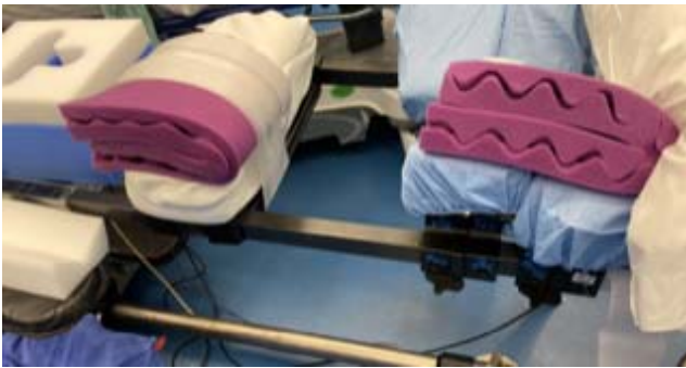
Figure 4. Asymmetrically padded chest and pelvis bolsters on the side of lateral lumbar interbody fusion (LLIF) insertion.

performed in addition to interbody device and pedicle screw placement. As in standard prone cases, in single-position prone cases, a 6-post Jackson frame can be used. It is beneficial to asymmetrically pad the chest and pelvis bolsters on the side of LLIF insertion to allow ease of access to the surgical field (Figure 4). The pelvis bolster on the implant insertion side should be positioned more caudad than the contralateral side (Figure 5); this positioning allows hyperlordosis on the approach side that mimics the tissue tension achieved in lateral position LLIFs by breaking the table. 51,52 The patient should be secured thoroughly at the head, arms, chest, pelvis, and legs to allow bed rotation up to approximately 30° to 45°. In our institution, 4-inch silk tape is used to secure the patient's chest and pelvis above and below the surgical field, respectively (Figure 6). A Mayfield head holder can also be used to assist in limiting head rotation during the operation, especially in prolonged cases, to avoid pressure on the face and eyes.