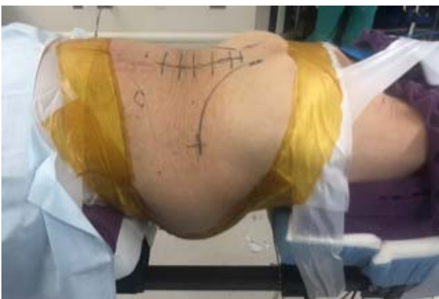
Figure 5. Pelvis bolster on the implant insertion side positioned asymmetrically caudad to facilitate hyperlordosis and tissue tension during lateral lumbar interbody fusion (LLIF).

performed in addition to interbody device and pedicle screw placement. As in standard prone cases, in single-position prone cases, a 6-post Jackson frame can be used. It is beneficial to asymmetrically pad the chest and pelvis bolsters on the side of LLIF insertion to allow ease of access to the surgical field (Figure 4). The pelvis bolster on the implant insertion side should be positioned more caudad than the contralateral side (Figure 5); this positioning allows hyperlordosis on the approach side that mimics the tissue tension achieved in lateral position LLIFs by breaking the table. 51,52 The patient should be secured thoroughly at the head, arms, chest, pelvis, and legs to allow bed rotation up to approximately 30° to 45°. In our institution, 4-inch silk tape is used to secure the patient's chest and pelvis above and below the surgical field, respectively (Figure 6). A Mayfield head holder can also be used to assist in limiting head rotation during the operation, especially in prolonged cases, to avoid pressure on the face and eyes.