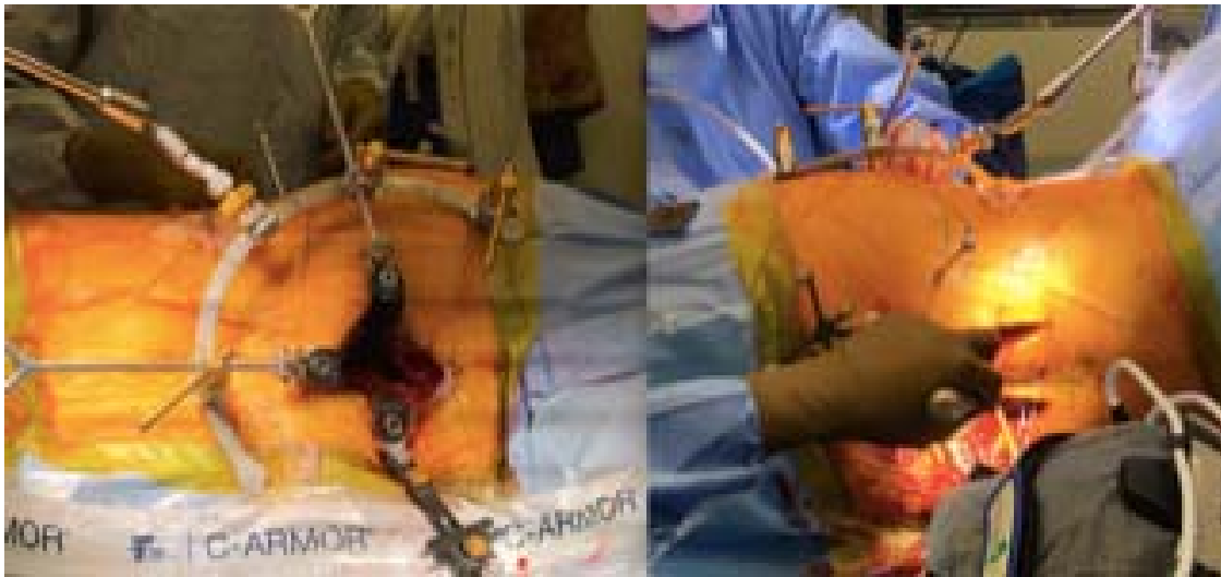
Figure 1. Draped surgical field for single-position lateral procedure with an anterior retroperitoneal lumbar approach.

Once the merge has been performed, the robot can be used on the posterior side, while concurrently an access surgeon may perform the anterior (retroperitoneal) approach to the lumbar spine, if indicated surgically (Figure 2). Pedicle screws should be placed in the contralateral (downside) pedicles first, followed by the ipsilateral (upside) pedicles to avoid obstruction of the surgical field by any incidental bleeding. Interbody device placement should be performed after the pedicle screws but before iliac screw fixation to avoid a registration shift and screw inaccuracy.