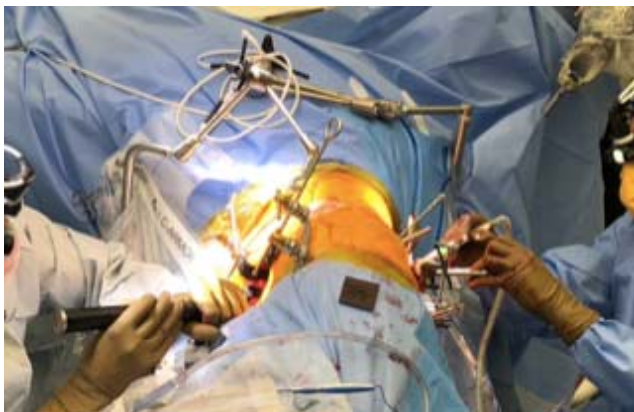
Figure 2. Single-position lateral approach allows shortened surgical time by avoiding need for bed change and allowing concurrent anterior and posterior surgery.

Single-position prone surgery may be beneficial if significant posterior work (osteotomies, decompression, or revision of previous hardware) needs to be