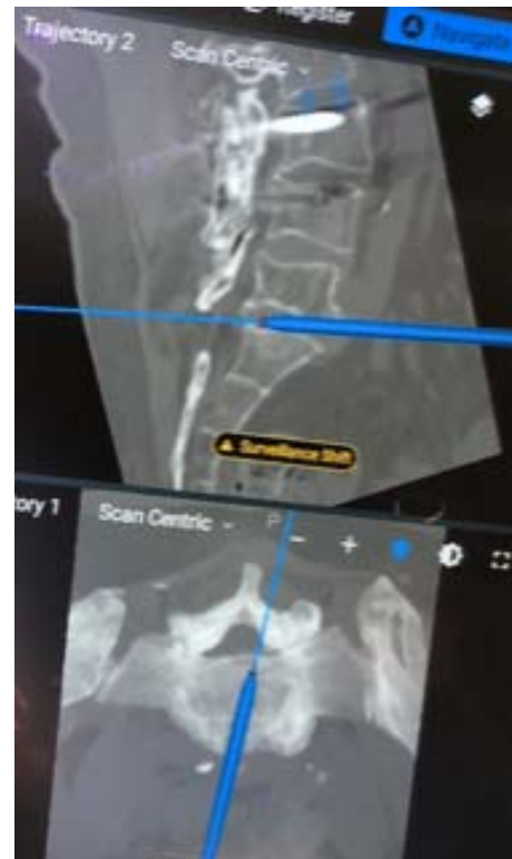
Figure 3. Navigated instruments can be used to localize and optimize angle during the approach and instrumentation.