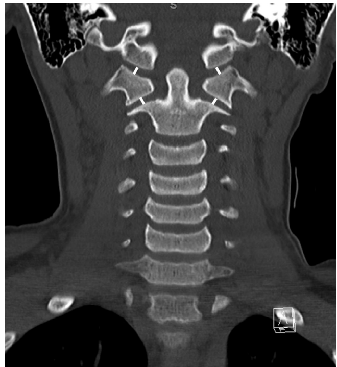
Figure 3. On the midcoronal image, the condylar-C1-interval is measured with a line in the middle of the joint drawn perpendicular to the joint surfaces; the lateral mass interval is drawn similarly with a line in the middle of the joint drawn perpendicular to the joint surfaces.