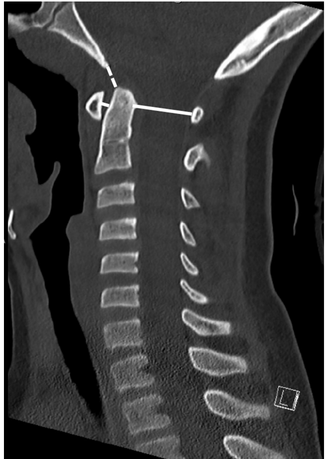
Figure 1. On the midsagittal image, the basion-dens interval (dashed line) is measured from the tip of the basion to the apex of the dens. The anterior atlanto-dens interval is measured between the posterior aspect of the anterior C1 arch and the anterior aspect of the odontoid process—the measurement is taken at the midpoint of C1. The posterior atlanto-dens interval is measured from the posterior aspect of the odontoid process to the anterior aspect of the posterior arch of C1.

Inter- and intraobserver error has previously been reported to be moderate-high for all measurements. In this study, each measurement was recorded by a single fellowship-trained spine surgeon, and intraobserver error was calculated by repeating all measures on a subset of 10 patients at an interval of 8 weeks to allow sufficient washout. Cronbach's \alpha values for each of the measures were as follows: BDI 0.797; ADI 0.919; PADI 0.980;