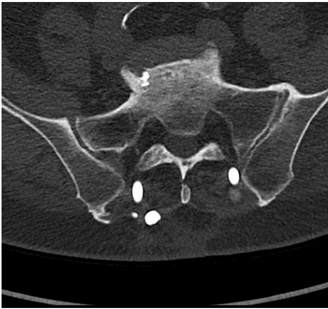
Figure 4. Axial computed tomography image demonstrating corresponding loosened set screw of empty iliac screw seen in Figure 3.