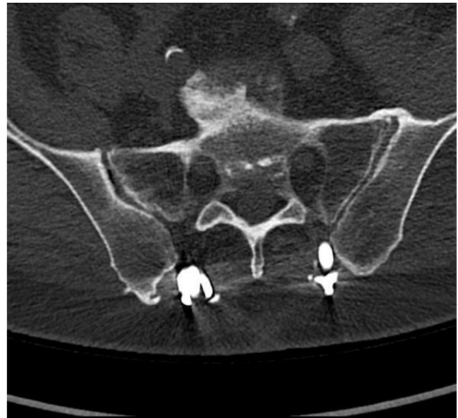
Figure 3. Axial computed tomography image demonstrating absence of set screw in right iliac screw.