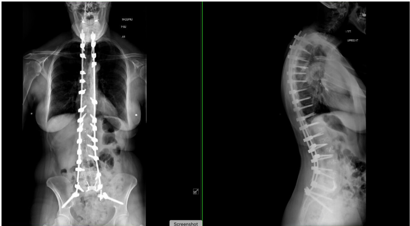
Figure 1. Anterior-posterior and lateral scoliosis films demonstrate rod fracture between L5 and S1, and below S1.

did need revision surgery. A further 5 patients had malpositioned screws that needed revision.