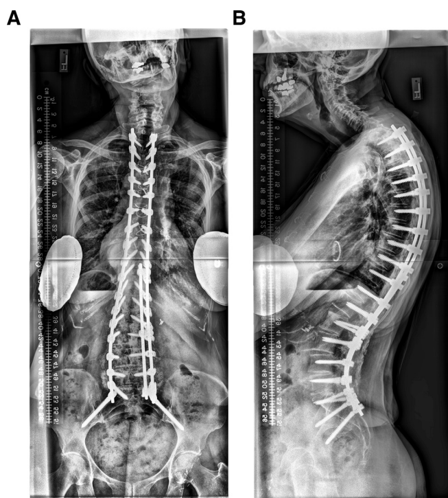
Figure 6. (A) Case example: follow-up coronal radiograph, (B) case example: follow-up lateral radiograph.

reliability of the predictive models created by the ESSG-ISSG calculator.