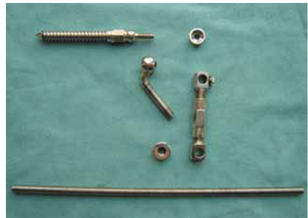
The composition of the IBLRFS

was connected with the pedicle screw and then fixed by nut A. Next, the angular lift was drilled through the round hole in the proximal end of the reduction rod and was fixed by nut B. On the surface and 15 mm under the posterior superior iliac spine, which clings to the sacrum, the halter was driven in, and then the halter was drilled through the round hole in the distal end of reduction rod. (The interval between the reduction rod and the angular lift should be 10–15 mm.) The support bar was