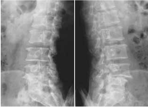
Preoperative bilateral radiographs. The defect is seen in the lucent gap in the are of the pars at L4.

The surgical outcome was evaluated using the Japanese Orthopaedic Association's Assessment of Treatment of Low Back Pain (JOA score). 4 The recovery rate was calculated using the following formula: (\text{postoperative score} - \text{preoperative score}) / (29 - \text{preoperative score}) \times 100 (\%) . Plain radiograph analysis was used to evaluate fusion status. The placement of the instrumentation was evaluated by two investigators who were not involved in the surgery or the postoperative care of these patients. Neurologic complications were assessed by review of preoperative, immediate postoperative, and clinical follow-up neurologic examinations. Instrumentation failure included screw breakage, rod breakage, or decoupling