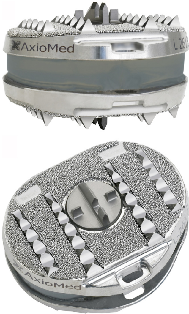
Fig. 1. Viscoelastic total disc replacement.

characterize the performance of the VTDR under single and coupled moments in flexion, extension, rotation, and lateral bending and to characterize any wear debris generated. Three discs were tested in flexion/extension to 10 million cycles and then in coupled lateral bending and rotation to 10 million cycles, all at a loading frequency of 2 Hz. An additional 3 discs were tested in reverse order. All testing incorporated a constant axial compressive load of 1,200 N. Flexion/extension tests were conducted in load control to \pm 10 Nm, lateral bending was conducted in load control at \pm 12 Nm, and rotation was controlled to \pm 3^\circ . Flexion/extension and lateral bending tests were conducted under load control because load control is more physiologic; the discs are loaded during daily activities and respond to those loads with motion. Rotation tests were conducted in displacement control because load control, as specified in the ASTM standard ( \pm 10 Nm), resulted in excessive, non-physiologic ( \pm 15^\circ ) motion of the VTDR. In vivo, rotation of the intervertebral discs is limited by the facets to approximately \pm 3^\circ ; therefore this was believed to be the more appropriate testing option.