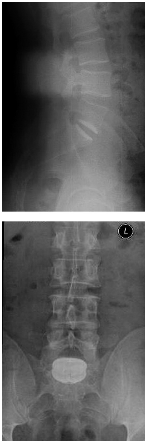
Fig. 4. Exemplar radiographs of a study patient.

were improved compared with their respective preoperative clinical status.