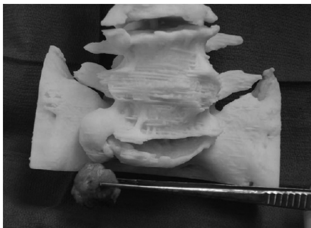
Fig. 3. A 3D model created from CT scans accurately portrayed the location and size of the osteophyte.

77% of patients in their retrospective review of preoperative CT scans in 27 patients showed an asymmetric enlargement of the anterior primary division of the L5 nerve root that was significantly associated with foraminal or extraforaminal compression of the root at the lumbosacral junction. In our case, even more valuable than the CT scan was its extrapolation to create a 3D model. This was helpful to the surgical team's understanding and visualization of the patient's anatomy and pathology. Intraoperatively, the surgeons repeatedly referred to the model. The resected osteophyte closely