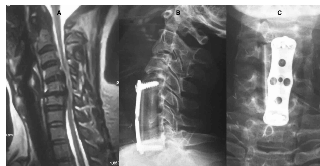
Fig. 2. 58 year old male. (A) T2 sagittal MRI showing cord compression and signal changes between C4-7, (B) and (C) 31 month postoperative antero-posterior and lateral X-ray showing C5 and C6 corpectomy and FVFG reconstruction fixed by anterior locked plate with solid fusion.