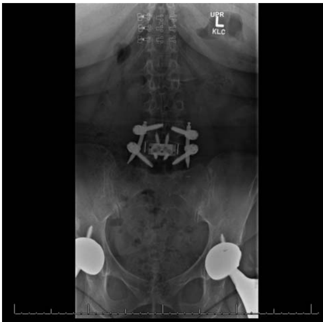
Figure 2. XXXX.

The standard deviation of the caudal curvature of the constructs with 2 ROCs is 28.5 (42% of the average), whereas the standard deviation of the cranial curvature of the constructs with 2 ROCs is 55.9 (53% of the average). The standard deviation of the average curvature of the constructs with 1 radius of curvature is 23.7 (40% of the average).