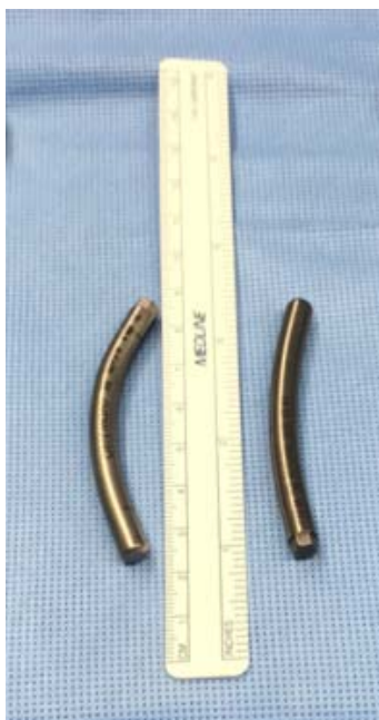
Figure 1. XXXX.

Study data were obtained through a retrospective chart review after institutional review board approval (17-2141). The medical records of patients who underwent posterior spinal surgeries involving 4 or less levels, utilizing PSSR (Medicrea, New York, NY) were compared with the standard rod radius of curvature. All surgeries were performed at a single institution by 1 of 3 surgeons from September 2016 through August 2018. Patient data, specifically the cranial and caudal radii of curvatures (ROCs) for each PSSR, were then compared with the industry standard prebent rod radius of 125 mm. Note, 3 level fusion PSSR rods had 2 different ROCs designated as the cranial and caudal radii. For example, in an L4-S1 fusion, the radius of