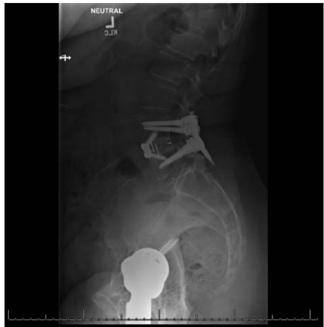
Figure 3. XXXX.

Surgical intervention for degenerative spinal conditions can be an effective treatment, improving patient outcomes. In recent years, the importance of preserving or correcting spinopelvic alignment in degenerative patients undergoing lumbar fusion surgeries has become apparent. There are an increasing number of articles addressing this issue in the current literature. This includes studies referring back to previous literature noting the importance of lumbar lordosis from L4-S1. 8 With the understanding that lordosis has a great impact on distribution of weight and force, outcomes can be greatly affected by even a small loss of lordosis during surgical intervention. Many studies indicate that an imbalance of the spinopelvic parameters following lumbar fusion can result in higher rates of adjacent segment disease and adjacent segment failure. This in turn can result in recurrence of pain, reoperation, and the need to extend the fusion or undergo deformity correction surgery. 16 Maintaining or correcting sagittal alignment in a short-