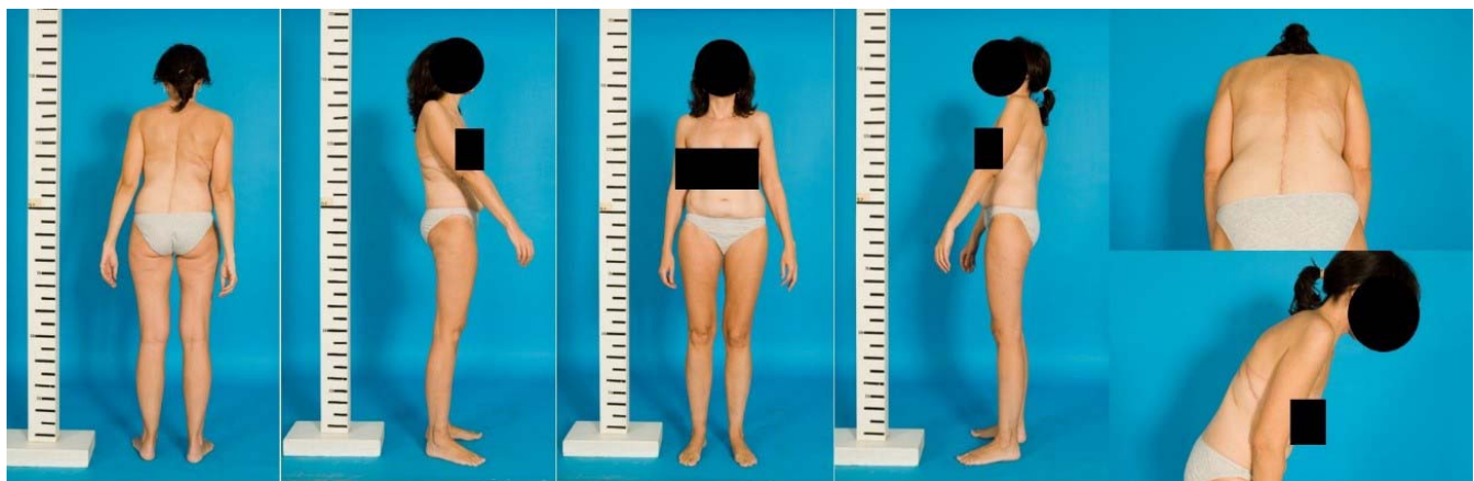
Figure 2. Final follow-up photographs of an adult idiopathic scoliosis patient (same patient as Figure 1).

multilevel fusion mass following a Harrington rod surgery, 1 patient had a history of a previous double approach for deformity surgery, and 2 patients had undergone prior lumbar fusion.