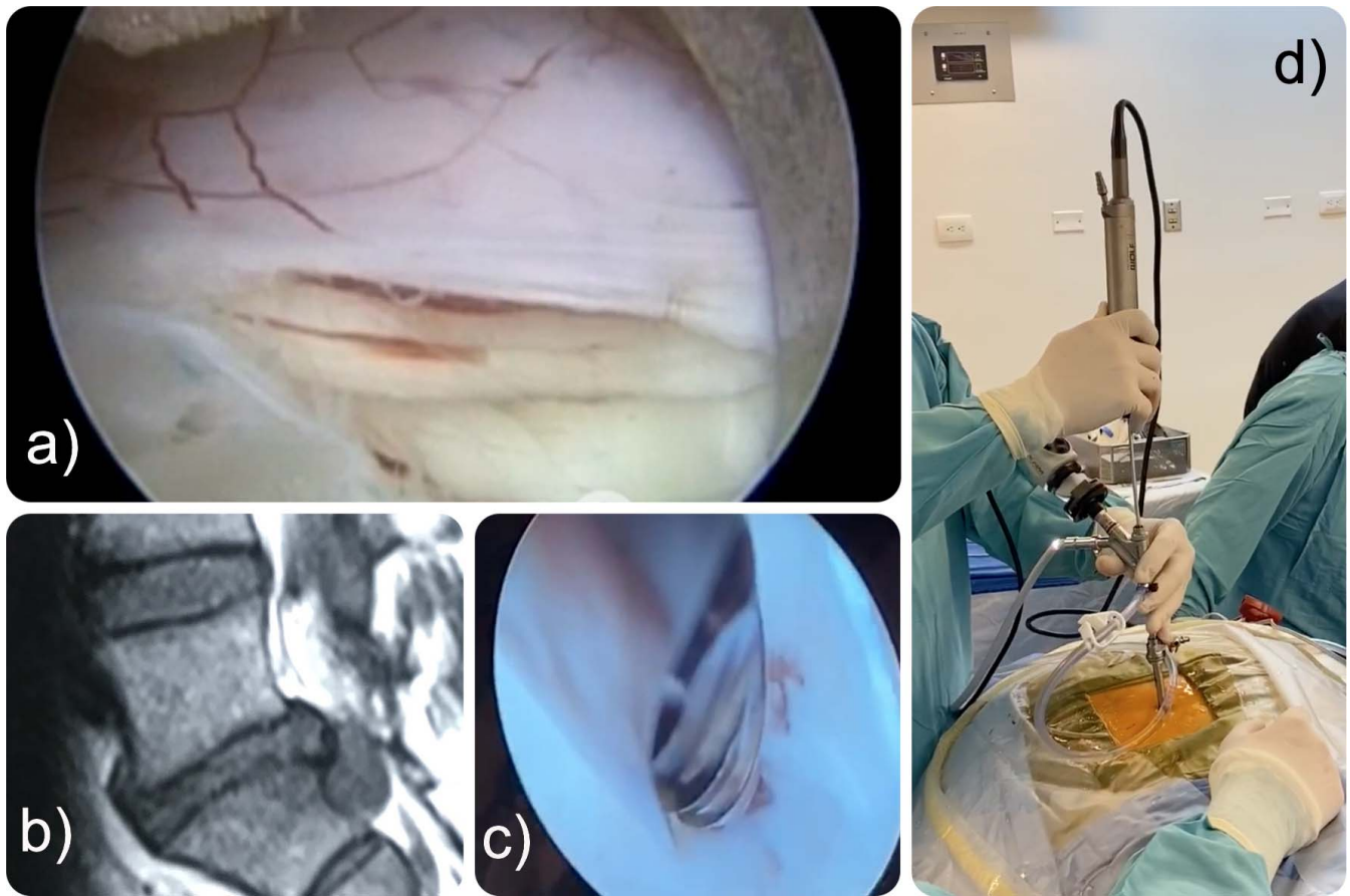
Figure 1. Shown is an exemplary case of (a) an incidental durotomy that the surgeon encountered in the posterior dura during interlaminar endoscopy (b) for a herniated disc at L5/S1 (c, d) with the application of a hooded power burr.

advanced cutting tools, such as reamers (22.8%; 21/92), trephines (21.7%; 20/92), and manual facet burrs (17.4%; 16/92) necessary for foraminal and lateral recess decompression, were involved in durotomy cases at nearly equal frequency. The use of endochisel instruments was associated with the lowest durotomy rate during lumbar endoscopy (8.7%; 8/92). The Kerrison rongeur was reported as the culprit by only 1 surgeon (1.07%; 1/93; Figure 3). Seventy-eight percent (78.3%; 72/92) of surgeons indicated that they would deal with an incidental durotomy by applying mechanical compression with Gelfoam. Application of a blood patch was reported as useful by only 2 surgeons, who free-texted their recommendation. Another 12% of surgeons (11/92) had no contingency plan and did not know what to do in case of an incidental durotomy during lumbar endoscopy. Only 7.6% (7/92) of surgeons anticipated that they would perform a conversion to open microsurgical decompression and dura repair. An even smaller proportion of respondents (2.2%; 2/92)