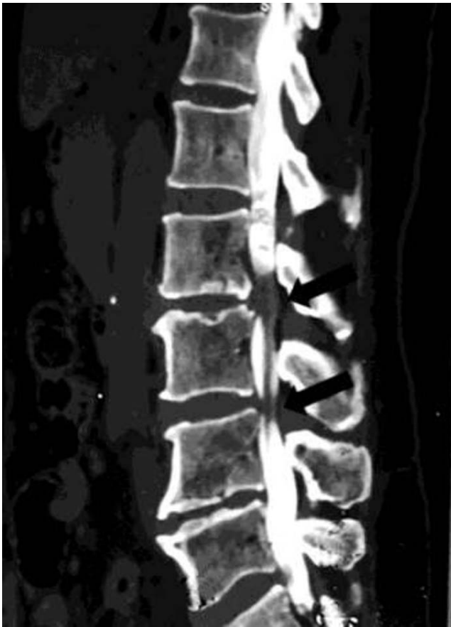
Figure 4. A 70-year-old woman presented with low back pain radiating to the left anterior aspect of the thigh and lateral aspect of the left leg with a claudication distance less than 500 m for the past 1 year. MRI showed multilevel compression. Computed tomography myelography (CTM) with curved sagittal reconstruction clearly showed canal stenosis at L2-L3 and a left paracentral compression at the L3-L4 levels. The patient underwent transforaminal lumbar interbody fusion (TLIF) at the L2-L3 and L3-L4 levels. At 6 months follow-up, she had no radicular pain and improved visual analog scale (VAS) and Oswestry Disability Index (ODI) scores.

with CTM. They concluded that myelography with CTM is more reliable and reproducible than MRI for preoperative evaluation of lumbar spinal canal stenosis.