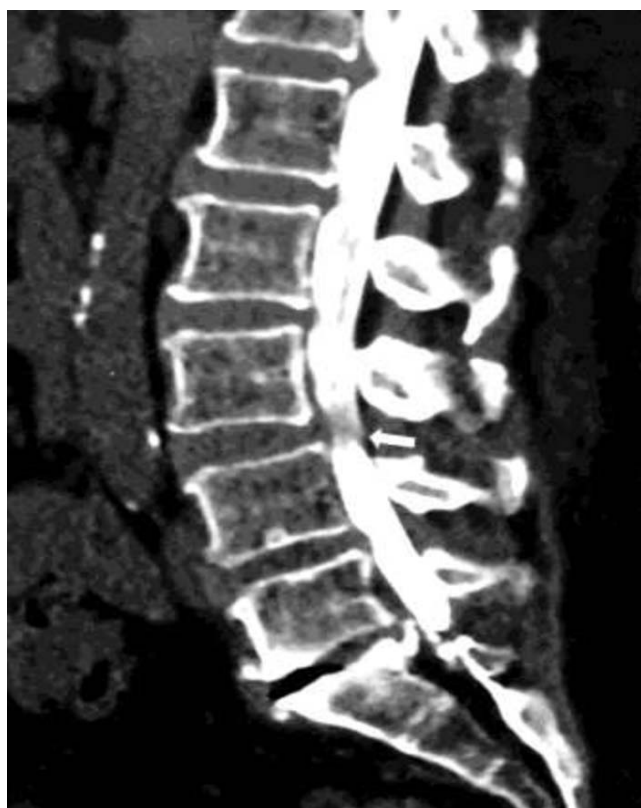
Figure 3. A 66-year-old lady with multiple comorbidities presented with low back pain radiating to both lower limbs (left more than right) with a claudication time of less than 5 minutes. MRI showed compression at multiple levels. Computed tomography myelography (CTM) curved sagittal reconstruction corrected for mild scoliosis and showed major compression at the L3-L4 level. Patient underwent transforaminal lumbar interbody fusion (TLIF) at the L3-L4 level, and at 6 months follow-up she had improved visual analog scale (VAS) and Oswestry Disability Index (ODI) scores. In such cases, multilevel decompression would have added increased surgical morbidity in a frail patient.

imaging criteria have been set to define the severity of the lumbar DDD. The cross-sectional spinal canal area has been used as an objective parameter, and an earlier study 14 revealed that preoperative symptoms of central spinal stenosis are related to the minimum cross-sectional area of subarachnoid space. However, another study 15 showed that the cross-sectional area varied extensively between patients and the existence of stenosis in a particular patient was difficult to predict.