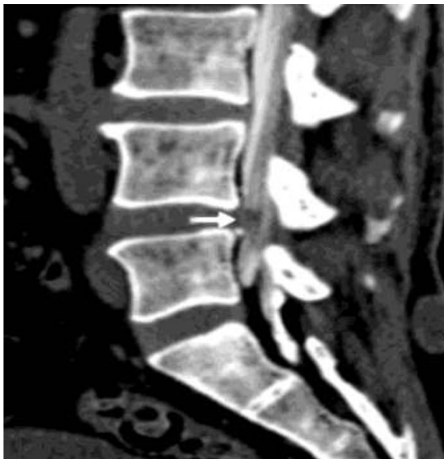
Figure 2. Root impingement. A 63-year-old gentleman presented with low back pain radiating to the left lower limb with a claudication time of 5 minutes for 6 months. MRI did not show any significant compression. Computed tomography myelography (CTM) showed left paracentral disc compressing the traversing nerve root at the L4-L5 level. Transforaminal lumbar interbody fusion (TLIF) L4-L5 was done, and at 6 months follow-up the patient had no radicular symptoms.

The decision for decompression surgery for symptomatic lumbar degenerative disorder largely depends on the severity of stenosis on imaging and clinical findings. However, no universally accepted