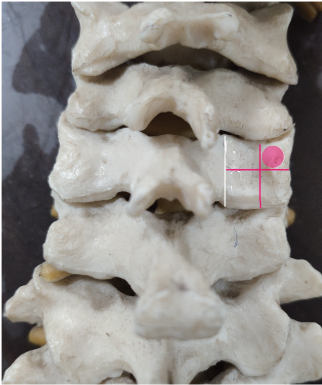
Figure 1. Diagram of freehand regional techniques (FRT). The entry point of FRT was located in outer upper quadrant of lateral mass.

mass of the subaxial cervical spine were labeled, dividing the lateral mass into 4 quadrants. The entry point was located in the outer upper quadrant of the lateral mass. The surface of cervical laminae should be exposed to determinate screws trajectories. The exposed area should extend from the medial edge of lateral mass to the spinous process. Screw trajectory should be perpendicular to the laminae (Figure 1). (Figure 2)