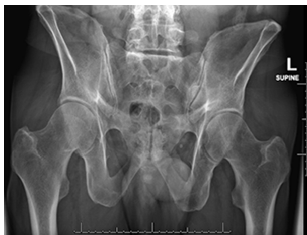
Figure 2. Normal morphology sacrum.