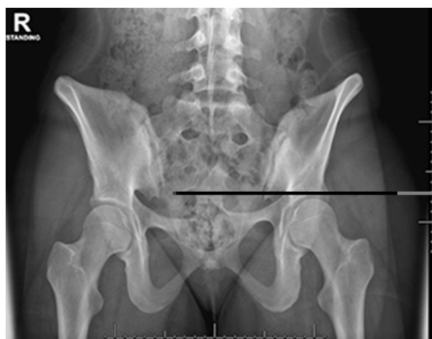
Figure 1. Dysmorphic sacrum as indicated by the upsloped sacral ala.

The senior author has done all of his cases using intraoperative navigation. It is also routine to do a postimplant placement check scan prior to leaving the operating room. This began in 2010. Having done >270 primaries (average 2.8 implants per case) and >60 revision cases, there have been well over 1000 implants