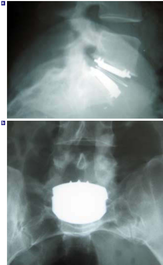
(a) Lateral and (b) anteroposterior postoperative lumbar x-rays showing proper positioning of the SB Charité III at the L5–S1 level.

Postoperatively, the patient had excellent relief of her left lower extremity symptoms and was discharged home one day after the surgery. However, several weeks later, the pain began to recur. Because the patient's initial improvement indicated that her symptoms were reversible, and because nerve root compression was identified intraoperatively, the patient elected for reexploration with partial facetectomy and posterior dynamic stabilization.