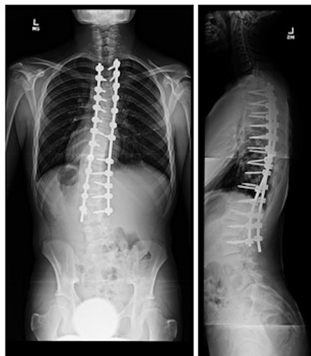
Fig. 2. Post-operative coronal (left) and sagittal (right) radiographs of a 17 year old male with adolescent idiopathic scoliosis who underwent posterior spinal fusion (T3-L3). Estimated blood loss was 4500cc and 3 units of allogenic packed red blood cells were transfused.

The proportion of patients assigned to EACA, TXA and/or saline did not differ between PD and non-PD groups ( p=0.26 ). The PD group was 75% female (21F, 7M), and Non-PD group was 78% female (76F, 21M). The mean age of the PD group trends to a higher age ( 15.6 \pm 2.2 vs 14.8 \pm 2.2 years, p=0.081 ), although this was not statistically significant. The BMI of the PD was slightly higher than Non-PD ( 23.1 \pm 4.2 versus 21.7 \pm 5.3 , p=0.219 ), although this difference was not statistically significant. The estimated blood volume for the patients that pre-donated was significantly higher ( 4444 \pm 1142 vs 3881 \pm 1060 , p=0.017 ). (Table 1)