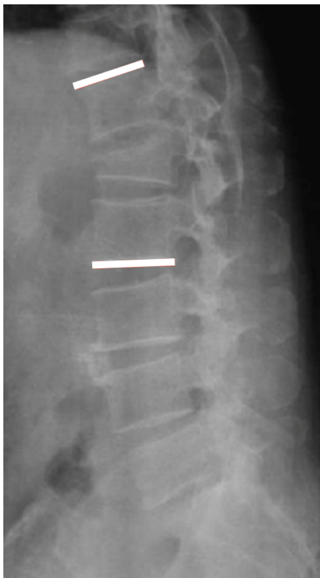
Fig. 1. Lateral radiograph demonstrating measurement of Cobb angle and segmental kyphosis.

Inclusion criteria included: skeletally mature patients with no age restriction, no gender restriction, presence of a thoracolumbar fracture (T10-L2), surgical management and follow up of at least 6 months.