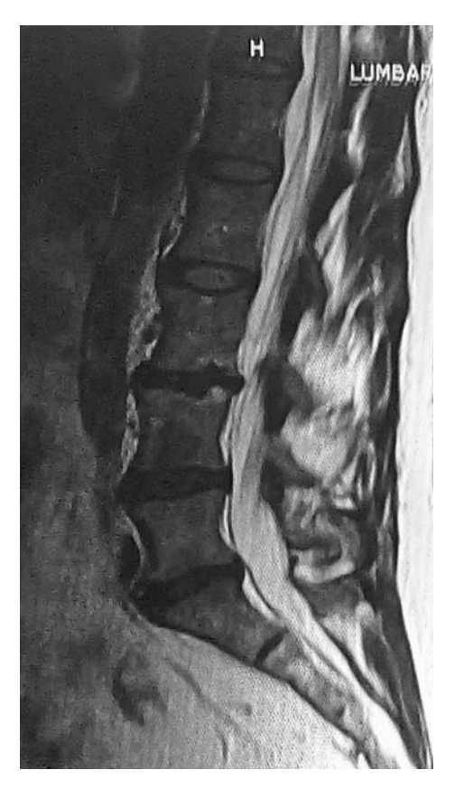
Figure 1. Magnetic resonance image showing lumbar degenerative disc disease with L3-4 stenosis.

had some degeneration at L4-5 and L5-S1. To ensure that the L3-4 level was the main pain generator, provocative discography was done with proximal and distal controls, confirming the L3-4 level as the primary pathology. We offered her either a minimally invasive transforaminal lumbar interbody fusion or a minimally invasive direct lumbar interbody fusion with posterior interspinous plating. The LLIF and plating were chosen.