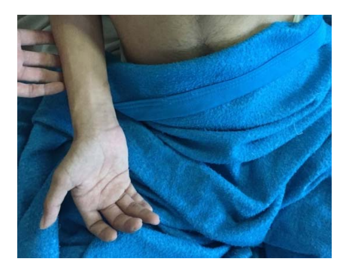
Figure 1. Clinical picture of maximum handgrip ability of the right hand.

There was progressive neurologic improvement during the early postoperative period. On day 5, the