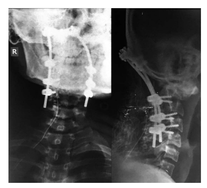
Figure 6. Radiograph of cervical spine after occipitocervical fusion.