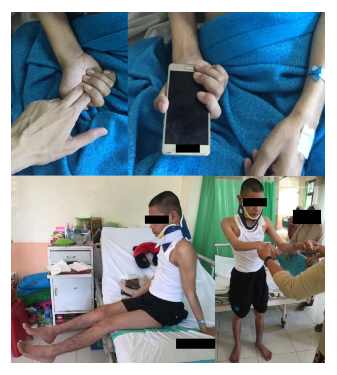
Figure 7. Ability to perform handgrip by day 5 (top); ability to sit independently with extended knee, and assisted walking (bottom) by day 10.

meningitis.<sup>14</sup> Most surgeons preferred posterior fixation following anterior release, although other options, including posterior occipitocervical fusion and posterior transarticular fusion with C1 to C2 pedicle screws fixation, is still possible.<sup>5,10</sup>