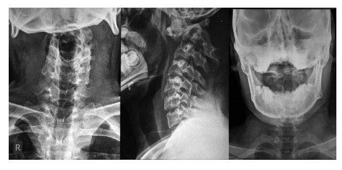
Figure 2. Radiograph of the cervical spine: Antero-posterior, lateral, and open mouth position.

intervention remains the most viable option in achieving fracture union.<sup>3,5</sup> To date, there is still no known consensus for the treatment algorithm of Jefferson fracture-dislocation associated with an odontoid fracture, and thus several authors have employed different management protocol and surgical technique in handling these cases.<sup>11</sup>