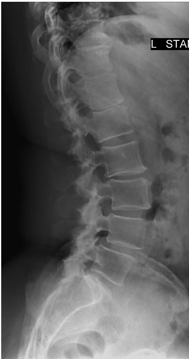
Figure 1. Preoperative radiographs demonstrating degenerative spondylolisthesis at L4–L5.

the interruption of the posterior elements, a low-grade IS patient has an inherent instability that may result in greater anterolisthetic progression compared to a low-grade DS patient. 7–10