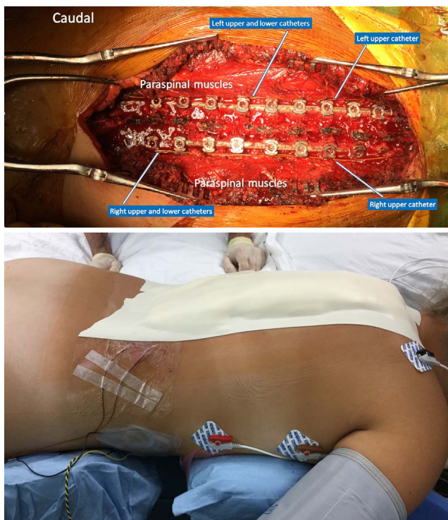
Figure 1. (a) Dorsal ramus nerve catheters prior to closure. (b) Dorsal ramus nerve catheters after closure (right side).

No complications were noted during hospitalization or in the postoperative period. Patients reported their pain was well controlled. Patients were able to participate in physical therapy, eat, and