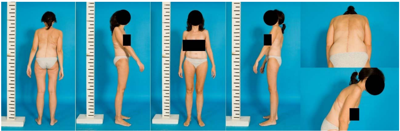
Figure 2. Final follow-up photographs of an adult idiopathic scoliosis patient (same patient as Figure 1).

multilevel fusion mass following a Harrington rod surgery, 1 patient had a history of a previous double approach for deformity surgery, and 2 patients had undergone prior lumbar fusion.