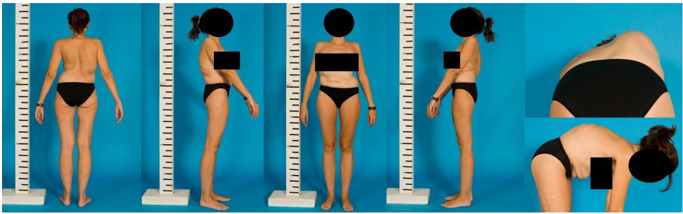
Figure 1. Preoperative photographs of an adult idiopathic scoliosis patient.

deformity patients their preoperative and postoperative whole-body photographs.