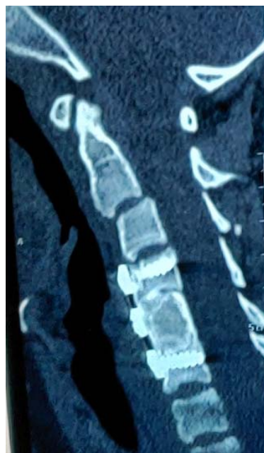
Figure 4. Sagittal computed tomography scan at 12 months postsurgery depicting solid anterior fusion.

A 40-year-old woman presented with neck pain and imbalance during walking for 3 weeks. Neurologically she had no loss of motor power but did have hyperreflexia and spasticity in all 4 limbs. Radiological investigations revealed destruction of C3 and C4 with cord compression (Figure 6A–6D). The patient was started on antitubercular chemotherapy and underwent surgical decompression and stabilization by anterior approach. Anterior column reconstruction was done by iliac crest autograft (Figure 6E). The patient remained neurologically intact at final follow-up and demonstrated solid bony fusion (Figure 6F).