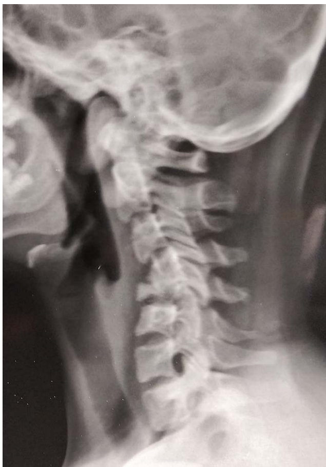
Figure 1. Plain lateral radiograph of a 24-year-old woman with C4-C5 tuberculosis and 30.6° kyphosis in the subaxial cervical spine.

patients with Frankel grade E continued to have the same grading in the postoperative period and at final follow-up. There was only 1 patient with Frankel grade A at presentation that improved to grade C within 6 months postsurgery.