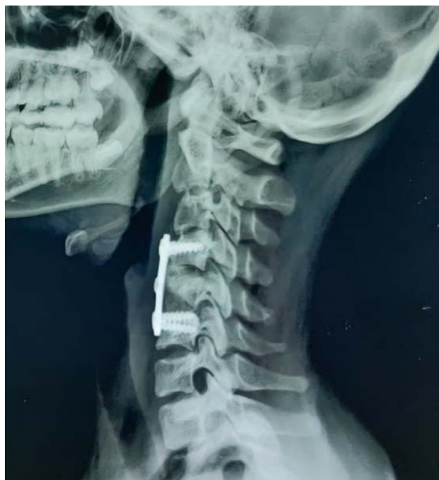
Figure 3. Postoperative plain lateral radiograph demonstrating correction of cervical alignment to lordosis, anterior instrumentation with a plate, and reconstruction with tricortical autologous bone graft.

of lower limbs. She was ambulatory at presentation. Plain radiographs revealed destruction of C5 and C6 vertebral bodies (Figure 5A). T2 sagittal MRI demonstrated retropulsion of C5 and compression of spinal cord (Figure 5B). T2 axial MRI showed severe ventral compression of cord with loss of cerebrospinal fluid signal (Figure 5C). The patient also had a skip lesion at D11-D12 with no cord compression (Figure 5D). She underwent anterior surgery with debridement, bone grafting, and anterior plating (Figure 5E and 5F). She recovered to Frankel grade E at the time of final follow-up.