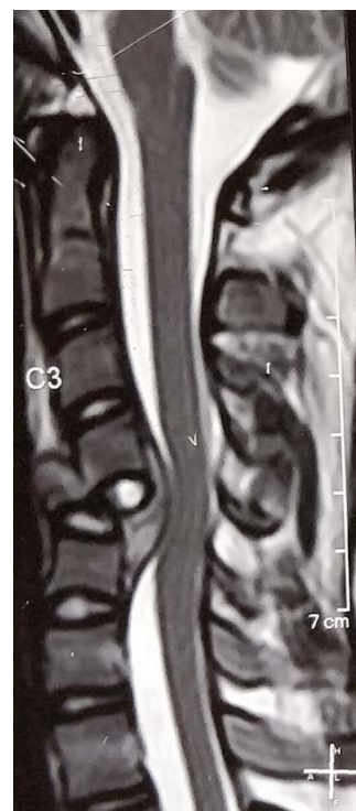
Figure 2. T2-weighted sagittal MRI depicting extensive vertebral body destruction and abscess causing compression of the spinal cord.

The Cobb angle at presentation ranged from 2°–58° of kyphosis with an average kyphosis of 15.4°. The average lordosis after surgery was found to be 17.5° (ie, a mean correction of 32.9°). The maximum correction was achieved in a 35-year-old woman with tubercular involvement of C5-C6 vertebrae, where a preoperative kyphosis of 58° was corrected to 6° of lordosis in the postoperative period. An average loss of 2.6° of lordosis was seen at final follow-up in the series. Time to union as assessed by x-ray and CT scan (if required) ranged from 3–9 months, with an average of 5.59 months. Three patients complained of temporary dysphagia lasting for an average of 3 weeks postsurgery but that later resolved without any additional intervention. One patient had superficial wound dehiscence at the graft site that healed by daily dressing. Another patient