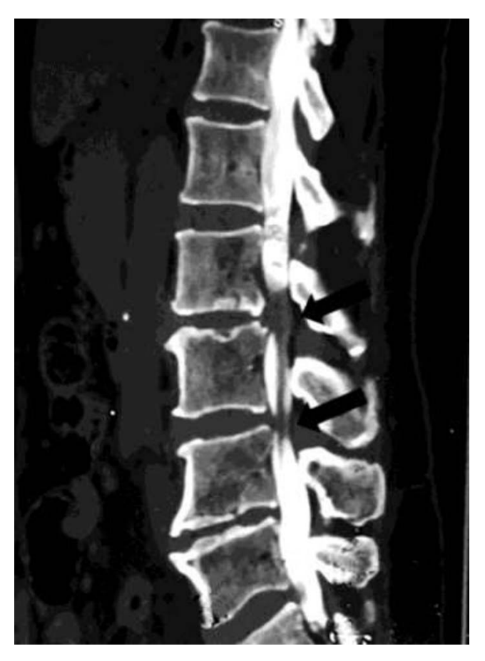
Figure 4. A 70-year-old woman presented with low back pain radiating to the left anterior aspect of the thigh and lateral aspect of the left leg with a claudication distance less than 500 m for the past 1 year. MRI showed multilevel compression. Computed tomography myelography (CTM) with curved sagittal reconstruction clearly showed canal stenosis at L2-L3 and a left paracentral compression at the L3-L4 levels. The patient underwent transforaminal lumbar interbody fusion (TLIF) at the L2-L3 and L3-L4 levels. At 6 months follow-up, she had no radicular pain and improved visual analog scale (VAS) and Oswestry Disability Index (ODI) scores.

CT in surgical planning of decompressive levels by tasking 4 spine surgeons to decide levels of decompression retrospectively on different occasions based on the findings of MRI or myelography with CTM. They concluded that myelography with CTM is more reliable and reproducible than MRI for preoperative evaluation of lumbar spinal canal stenosis.