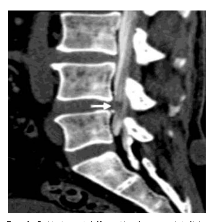
Figure 2. Root impingement. A 63-year-old gentleman presented with low back pain radiating to the left lower limb with a claudication time of 5 minutes for 6 months. MRI did not show any significant compression. Computed tomography myelography (CTM) showed left paracentral disc compressing the traversing nerve root at the L4-L5 level. Transforaminal lumbar interbody fusion (TLIF) L4-L5 was done, and at 6 months follow-up the patient had no radicular symptoms.

MRI has become the primary diagnostic imaging modality over the last 2 decades for degenerative disorders of the lumbar spine. Despite its efficacy and noninvasive nature, clinicians are confronted