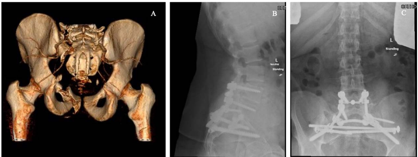
Figure 4. Preoperative and postoperative imaging of spinopelvic trauma treated with L4-iliac fusion with distal ventral iliac pathway screws. (A) Three-dimensional reconstruction of preoperative computed tomography scan demonstrating left lateral compression 3 pelvic ring injury with a left complete displaced comminuted zone 2 sacral fracture, right sacroiliac joint dislocation, left segmental superior and inferior ramus fractures, L1–L5 left transverse process fractures, left L5 pedicle fracture, and right S1 pedicle fracture, constituting a form of spinopelvic dissociation. (B) and (C) Postoperative sagittal and anterior-posterior x-rays at 24 months follow up demonstrating stable fusion without hardware failure.

record and deemed eligible for inclusion in this study. All DVIP screws were placed in the setting of spinal deformity surgery by the senior author. For these procedures, mean estimated blood loss, operative time, and fluoroscopy time were 1959 mL, 386 minutes, and 3.19 minutes, respectively. Intraoperative complications include 12 incidental durotomies, which were repaired without negative sequelae. Three suprafascial infections and 2 compressive hematomas requiring surgical debridement and drainage were identified in the early postoperative period. Late postoperative complications included 22 instances of hardware failure (mean = 17.9 months to radiographic identification). These