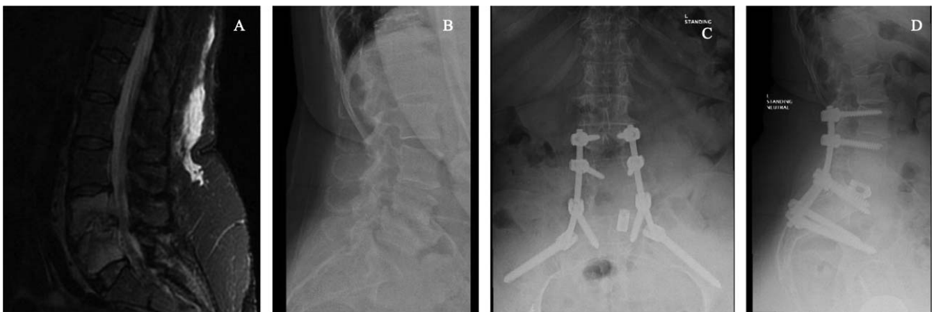
Figure 5. Preoperative and postoperative imaging demonstrating osteomyelitis or discitis treated with L3-iliac fusion using distal ventral iliac pathway screws. Preoperative sagittal magnetic resonance imaging demonstrating osteomyelitis or discitis with infectious destruction of L4–5, epidural enhancement, kyphotic collapse, and central canal stenosis. Preoperative lateral x-ray of the lumbar spine demonstrating pathologic kyphotic collapse. Postoperative anterior-posterior and lateral x-rays at 24 months follow up demonstrating solid fusion without hardware failure.

included 12 rod fractures, 4 DVIP set cap dissociations, 5 proximal screw-rod dissociations, and 1 pedicle screw head fracture. There were no instances of DVIP screw fracture. Twenty-six patients required revision surgery (mean = 22.1 months postoperatively). Revision surgery was required in 11 patients with hardware failures (mean = 13.8 months postoperatively). DVIP screws were removed electively in 9 patients due to sacral pain and prominence (mean = 26.9 months postoperatively). Eight patients with documented lumbosacral pseudarthrosis underwent revision surgery (mean = 26.1 months postoperatively). Two patients who