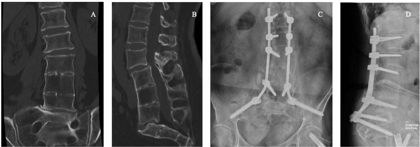
Figure 3. Preoperative and postoperative imaging of lumbosacral deformity treated with L1-iliac fusion with distal ventral iliac pathway screws. (A) and (B) Preoperative sagittal and coronal computed tomography scan of patient with vertebrae-anal-trachea-esophagus-renal syndrome and sagittal imbalance demonstrating autofusion of L3–5 with associated stenosis and listhesis as well as sacral dysgenesis. (C) and (D) Postoperative sagittal and anterior-posterior x-rays at 29 months follow up demonstrating solid fusion with absence of hardware failure.

formed at L5–S1. At the most recent follow up, 29 months postoperatively, there was no evidence of hardware failure, deformity progression, or pseudoarthrosis (Figure 3).