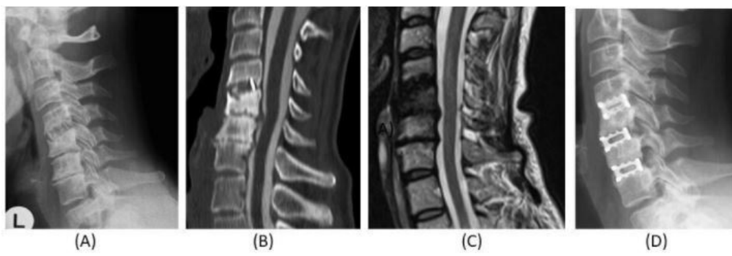
Figure 1. (A) Plain x-ray, (B) preoperative computed tomography, and (C) preoperative magnetic resonance imaging of a 52-year-old male patient presenting with symptomatic pseudarthrosis C4/5 18 months after anterior cervical decompression and fusion (ACDF). The preoperative workup showed an additional adjacent segment disease, C5-7. He was treated by anterior revision and ACDF C5-7 and achieved solid arthrodesis at the final follow-up (D).

The third group included 20 patients undergoing a combined approach. Anteriorly, the pseudarthrosis was excised, and a re-fusion was performed using cages and bone graft. Posteriorly, a posterior midline incision with the lateral mass screw-rod system or a reconstruction plate and fusion using iliac bone graft was used. This group of patients had either a long segment fusion (3