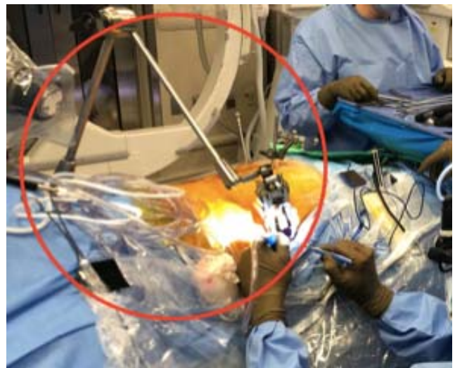
Figure 7. Positioning of the clamp for the lateral lumbar interbody fusion (LLIF) retractor positioned contralateral side to the LLIF insertion.

As in the single-position lateral cases, the fiducial should be placed in the iliac crest midway between the PSIS and the apex of the iliac crest at the lateral flank on the ipsilateral side to the LLIF insertion. The surveillance marker should be placed in the contralateral PSIS away from the LLIF insertion. As in standard prone positioning, the surveillance marker should be placed and registered before the merge to provide a secondary check on accuracy in