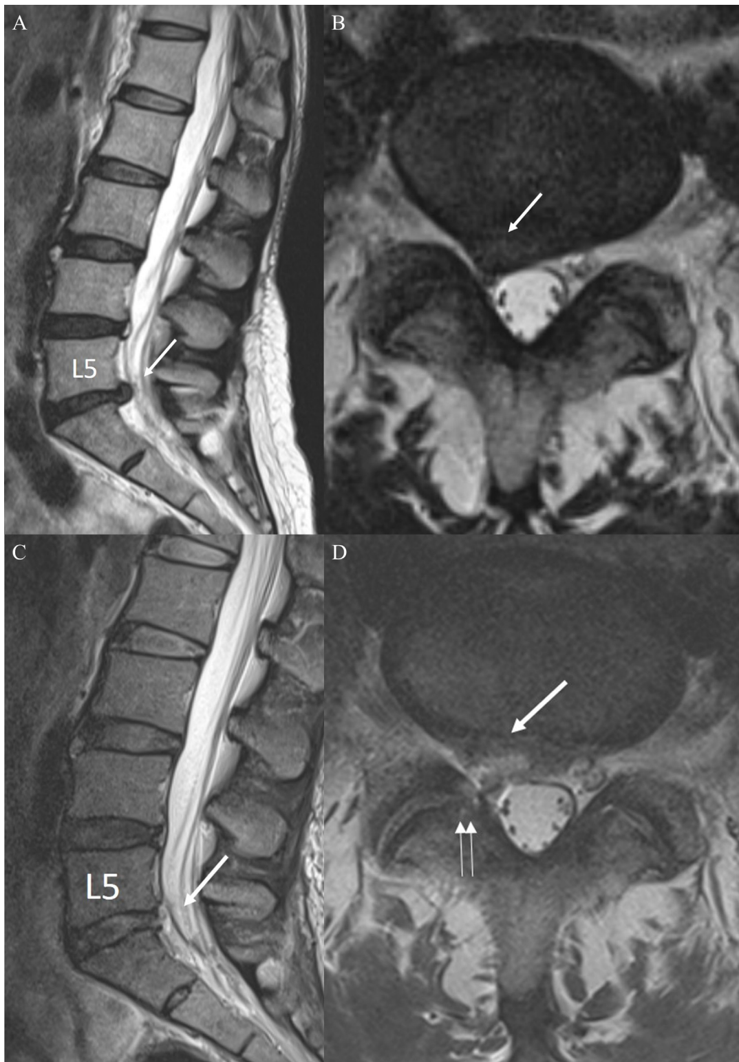
Figure 2. Case. Preoperative T2-weighted magnetic resonance images of a sagittal cut (A) and an axial cut (B) showed a protruded disc (white arrow). Postoperative magnetic resonance images (C and D) showed a sufficiently decompressed nerve root after removal of the herniated disc (white arrow) and a defect of the ligamentum flavum (double white arrows).

interlaminar versus microsurgical laminotomy technique: a prospective, randomized, controlled study. Pain Physician . 2015;18(1):61–70. doi:10.36076/ppj/2015.18.61.