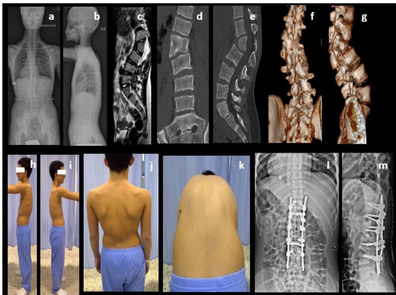
Figure 1. Preoperative x-ray images (a, b), magnetic resonance images (c), computed tomographic (CT) images (d, e), three-dimensional CT images (f, g), and clinical presentation (h–k) of the patient. Postoperative x-ray images (l, m).

failure, visceral or vascular iatrogenic injury, or massive hemorrhage). Despite not using IONM before 2011, as it was not available in our institution before that date, we did not have any serious nervous impairment in patients operated on before 2011, nor in patients operated on after that date with IONM aid.