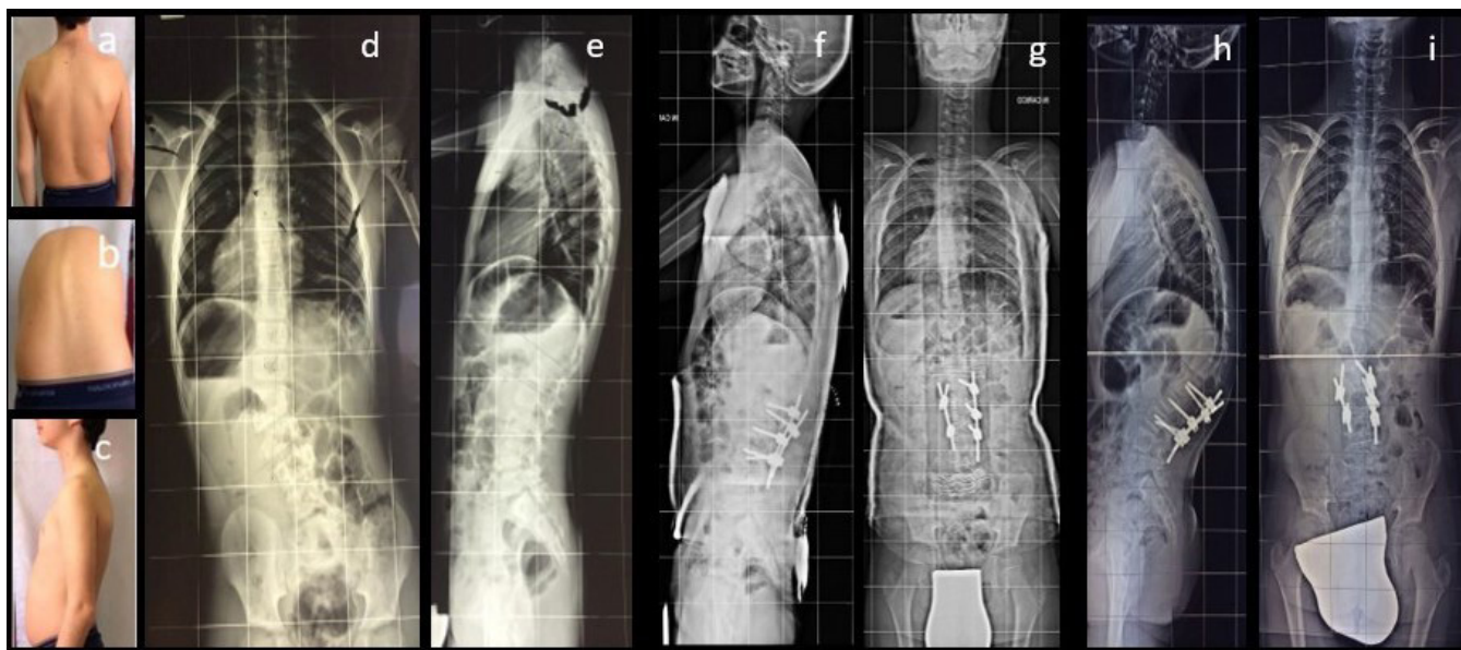
Figure 4. Clinical presentation (a–c) and preoperative x-ray images (d, e); postoperative x-ray images with cast (f, g); and 6 months follow-up x-ray images showing proximal junctional kyphosis (h, i).

In our series, the only patient with intraoperative pedicle fracture was a 25-month-old child. We rose the pedicle screw 1 level on 1 side, without impairment of instrumentation stability or of arthrodesis formation at