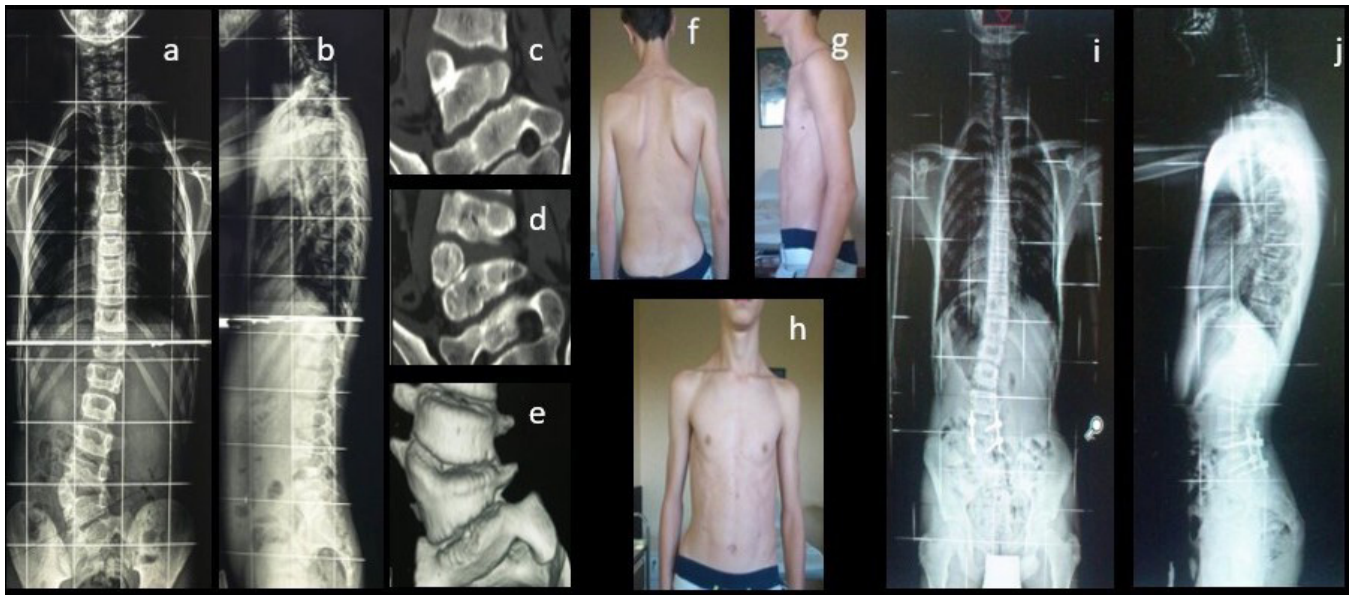
Figure 5. Preoperative x-ray images (a, b), computed tomographic (CT) images (c, d), and three-dimensional CT image (e); and clinical (f–h) and radiologic (i, j) findings at 8 months follow-up, showing small upper scoliotic curve development and slight cosmetic impairment.

follow-up (Figure 3). We believe that fracture is more likely due to surgical technique defect and not to intrinsic pedicle fragility. We operated on 13 patients under 6 years and one 6-year-old without any other pedicle fracture, secondary instrumentation mobilization or arthrodesis impairment at follow-up.