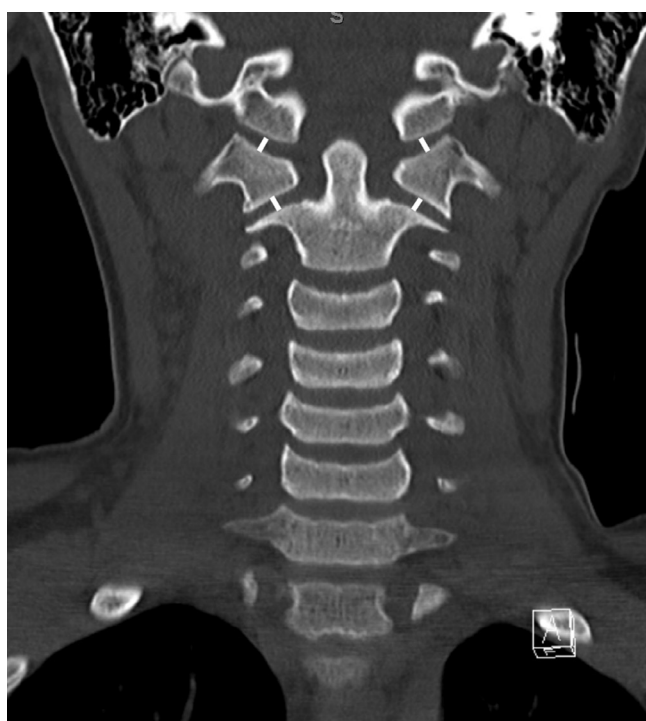
Figure 3. On the midcoronal image, the condylar-C1-interval is measured with a line in the middle of the joint drawn perpendicular to the joint surfaces; the lateral mass interval is drawn similarly with a line in the middle of the joint drawn perpendicular to the joint surfaces.