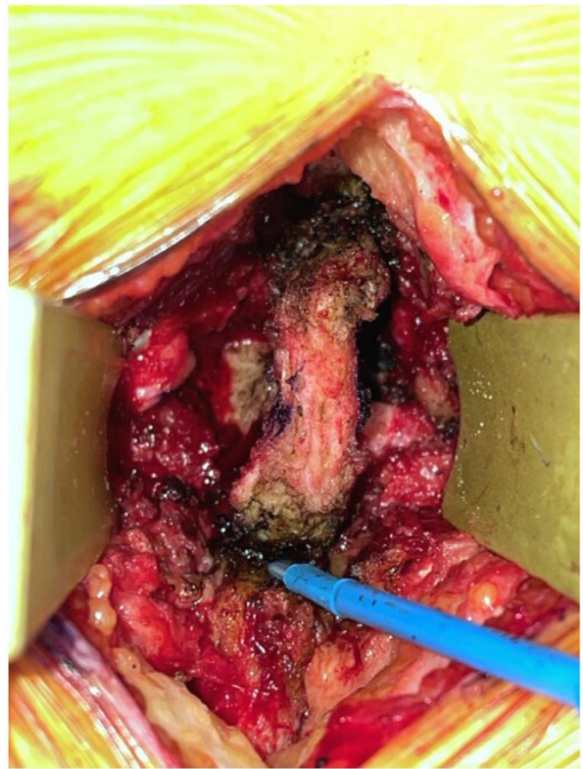
Figure 3. Division of the proximal and distal interspinous ligament with the Bovie.

The purpose of this study, therefore, is to outline and describe an innovative technique in detail while providing insight into its clinical application. The result of this study may represent a possible paradigm shift in the future of this procedure as it is becoming widely accepted as a safe alternative for this procedure.