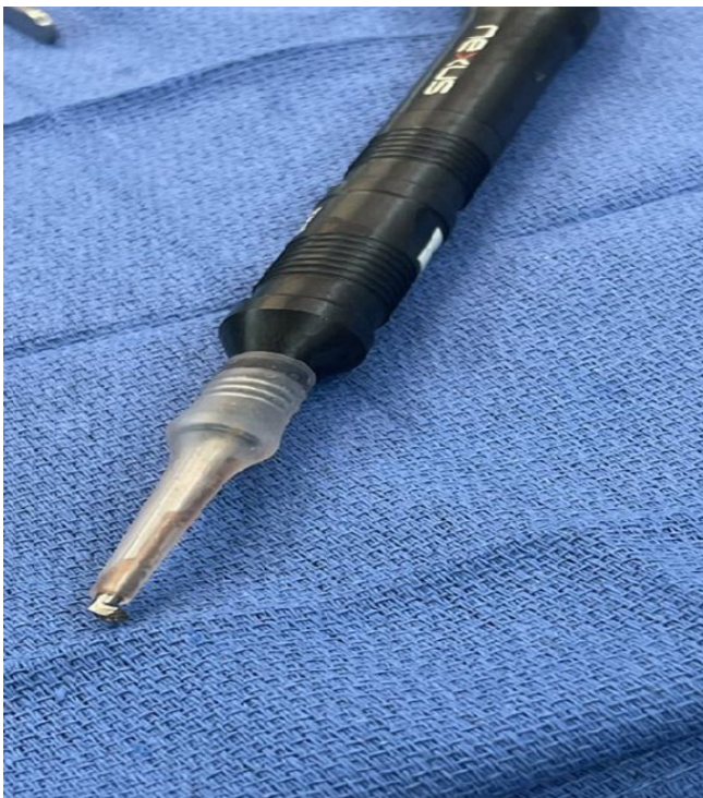
Figure 2. The BoneScalpel (Misonix) with hook shaver (widen laminectomy if needed).

After a standard subperiosteal dissection through an open or mini-open incision, the interspinous ligament should be divided with cautery or sharply (Figure 3), with the purpose of isolating the level(s) of interest. Rongeurs can be now used to bite the spinous process down to the level of the lamina until the ligamentum flavum can be plainly identified in relation to the lamina (Figure 4). The pars interarticularis should now be identified bilaterally. After marking a line or point that is at 5 mm from the pars' lateral extent, longitudinal troughs are cut from the top to the bottom of the lamina(e) of interest. At this point, the lamina does not need to be completely floating and freely detached. Next, a transverse trough (Figure 5A) is cut through the superior third of the respective lamina connecting the longitudinal troughs like the letter "H" (Figure 5B). A mallet and curved osteotome are now used to access, loosen, and mobilize the inferior laminar segment caudally (Figure 6). Once elevated away from the spinal canal, it is removed with rongeurs. Cottonoids are now placed onto the dura or remaining ligamentum flavum. Kerrison rongeurs are now used to remove the remaining