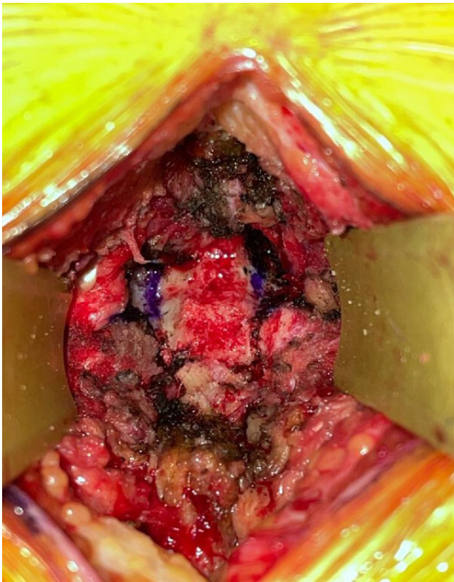
Figure 4. Removal of spinous process/superficial lamina.

superior third of the lamina (Figure 7). Immediate and direct visualization is afforded at all times so that cottonoids can again be used to protect the neural elements during the final stages of decompression (Figures 7 and 8).