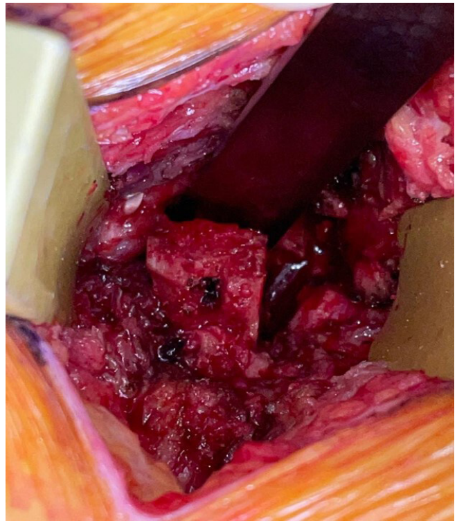
Figure 6. Elevation of the inferior (caudal) lamina with a curved osteotome.

retrospective analysis was then performed on all laminectomies in the surgeon’s practice from February 2018 to July 2021 to select the eventual cohort of interest.