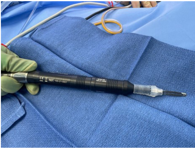
Figure 1. The BoneScalpel (Misonix) with 25-mm blade (to make laminectomy troughs).

The purpose of this study, therefore, is to outline and describe an innovative technique in detail while providing insight into its clinical application. The result of this study may represent a possible paradigm shift in the future of this procedure as it is becoming widely accepted as a safe alternative for this procedure.