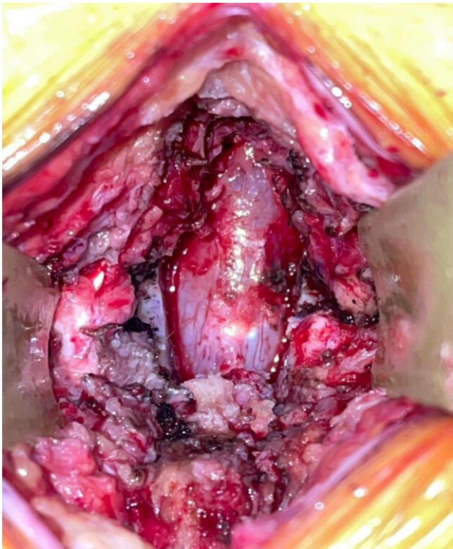
Figure 8. Completion of laminectomy.

Any patient who required a lumbar laminectomy in the study period was included if the levels of interest had not yet been laminectomized (even partially). An entire or full and intact lamina is required for this technique. Contraindications included cervical or thoracic laminectomies as well as revision lumbar laminectomies (segments that already had full or partial laminectomy).