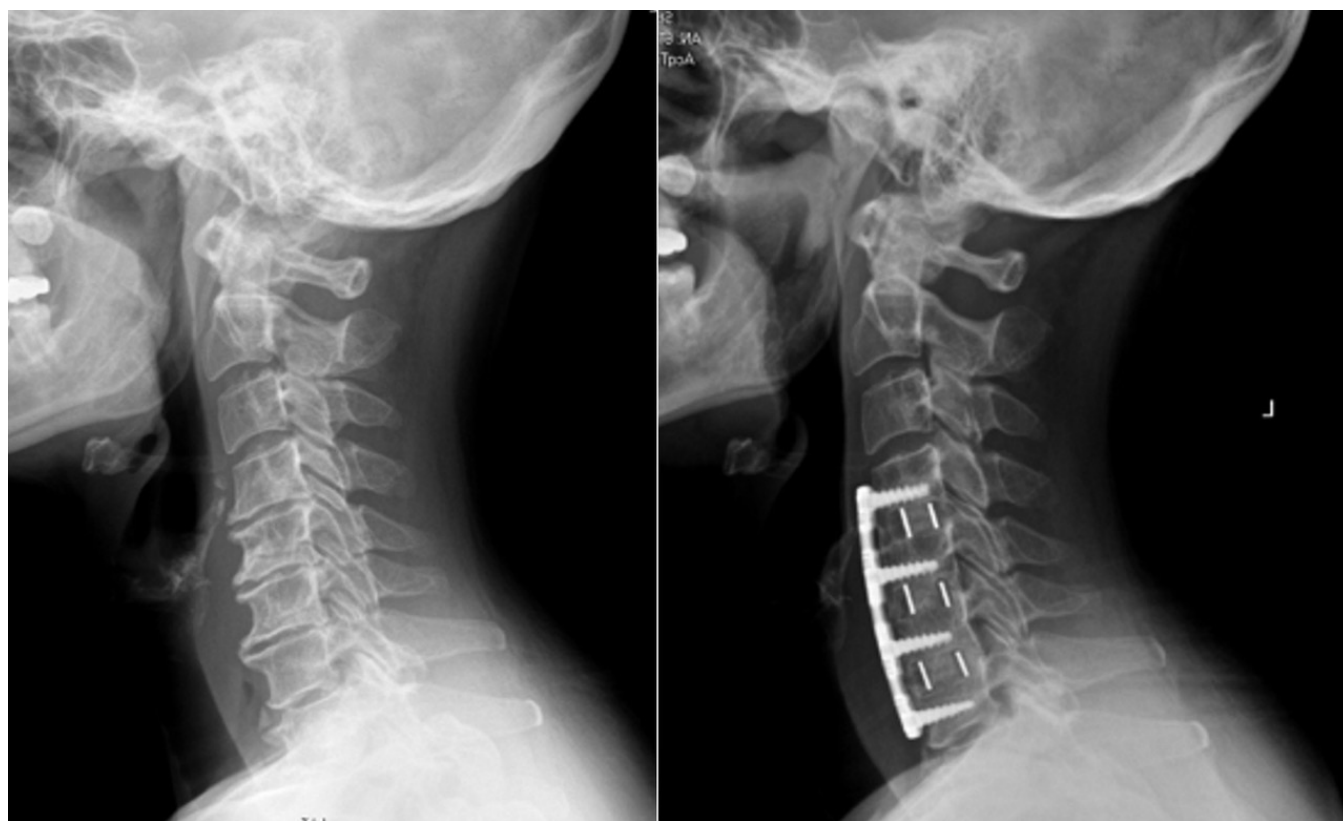
Figure 2. Preoperative (left) and postoperative (right) lateral radiographs of an exemplary case indicating achievement of multilevel lordosis and restoration of disc space height without subsidence. Robust interbody fusion is demonstrated at the operated levels.

cages and anterior plating, subsidence has been reported in 9.7 to 38.5% of cases between 6 and 24 months of follow-up. 30 Additionally, in the present study, porous PEEK cages had acceptable improvements and relative maintenance in disc height, SVA, C2-C7 lordosis, and fusion segment lordosis, postoperatively (Figure 2). These outcomes remained significant at the time of final follow-up, 1 year after surgery. While the numerical mean C2-C7 cervical lordosis at final follow-up was less than mean C2-C7 cervical lordosis at final follow-up, this difference was within 1° and was not statistically significant. This was likely due to minor variability in radiographic measurements. Additionally, while the numerical mean proximal adjacent segment lordosis decreased at final follow-up, this difference was not statistically significant and is well within the margin of measurement error and not likely a complication from the procedure. Last, while the mean disc height was less at final follow-up compared with mean disc height at the immediately postoperative visit, this difference was quite small (0.29 mm) and while statistically significant, it did not meet the threshold for subsidence and was therefore likely clinically insignificant.