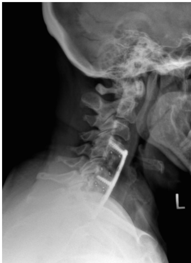
Figure 1. Skip corpectomy involving the C5 and C7 vertebral bodies.

The skip corpectomy procedure performed in this cohort was independently proposed and demonstrated in the early 2000s by 2 authors of the present study (F.F. and S.J.C.). Our technique is similar to that reported by Dalbayrak et al, who described a C4 and C6 corpectomy, C5 osteophyctomy, and decompression of the posterior-superior and posterior-inferior aspects of the C5 vertebral body. 21 In our cohort, a minority of patients underwent corpectomy at C5 and C7 (Figure 1). Pathologic intervertebral discs were removed at the intervening levels. Preservation of the central vertebral body (C5 or C6), as well as the vertebral endplates, is the essential aspect of this technique. Bone from the corpectomy levels was harvested for autograft. The operative microscope was used during resection of the posterior longitudinal ligament. Choice of cage was left to the discretion of the operating surgeon. Cages were packed with local autograft in addition to allograft and/or iliac crest aspirate. Intraoperative radiographs were obtained to confirm proper cage positioning. A fixed