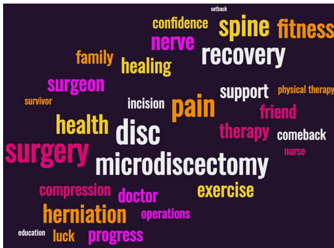
Figure 2. Word cloud representation of the most common text shared in microdisectomy-related posts.

lifestyle (daily activity, sports, and work) were more than 3 times as likely to be expressed in a positive tone compared with posts referencing medical matters (article/poster/advertisement, imaging, incision, clinic scene, operating room scene, medication) (OR = 3.14, CI = 1.85–5.33, P < 0.0001 ) (Table 4).