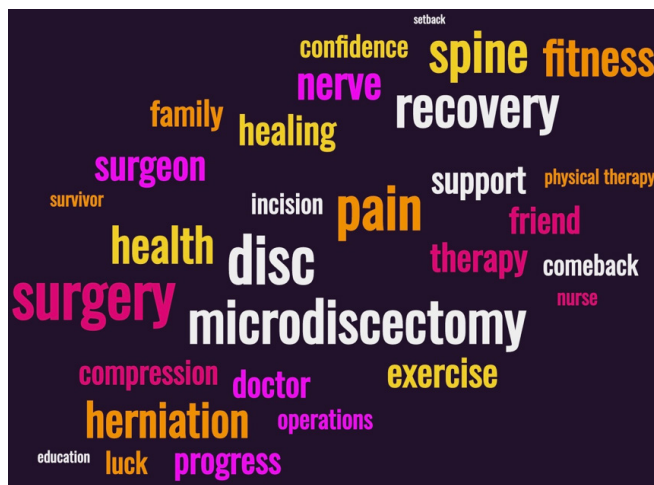
Figure 2. Word cloud representation of the most common text shared in microdiscectomy-related posts.

lifestyle (daily activity, sports, and work) were more than 3 times as likely to be expressed in a positive tone compared with posts referencing medical matters (article/poster/advertisement, imaging, incision, clinic scene, operating room scene, medication) (OR = 3.14, CI = 1.85–5.33, P < 0.0001 ) (Table 4).