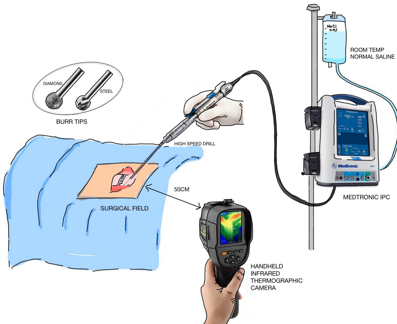
Figure 1. Diagram of the study setup.

rpm. Forward-looking infrared thermography was used in this study for temperature measurements. We used the Hikvision M30 handheld thermal camera (HikMicro, Hangzhou, China) with a resolution of 384 \times 288 (110,592 pixels), a thermal range of -20^{\circ}\text{C} to 550^{\circ}\text{C} with an accuracy of \pm 2\% .