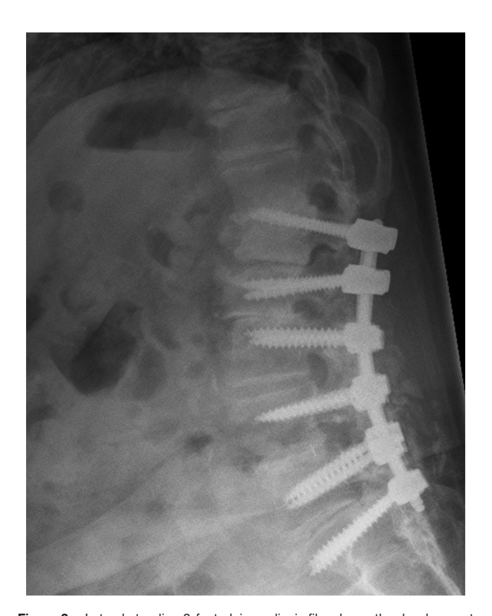
Figure 2. Lateral standing 3-feet plain scoliosis film shows the development of proximal junctional kyphosis.

of the fusion to T10 with accessory rod-connector placement from T10 to L2. This surgery corrected the patient's PJK, and her symptoms improved postoperatively (Figure 3).